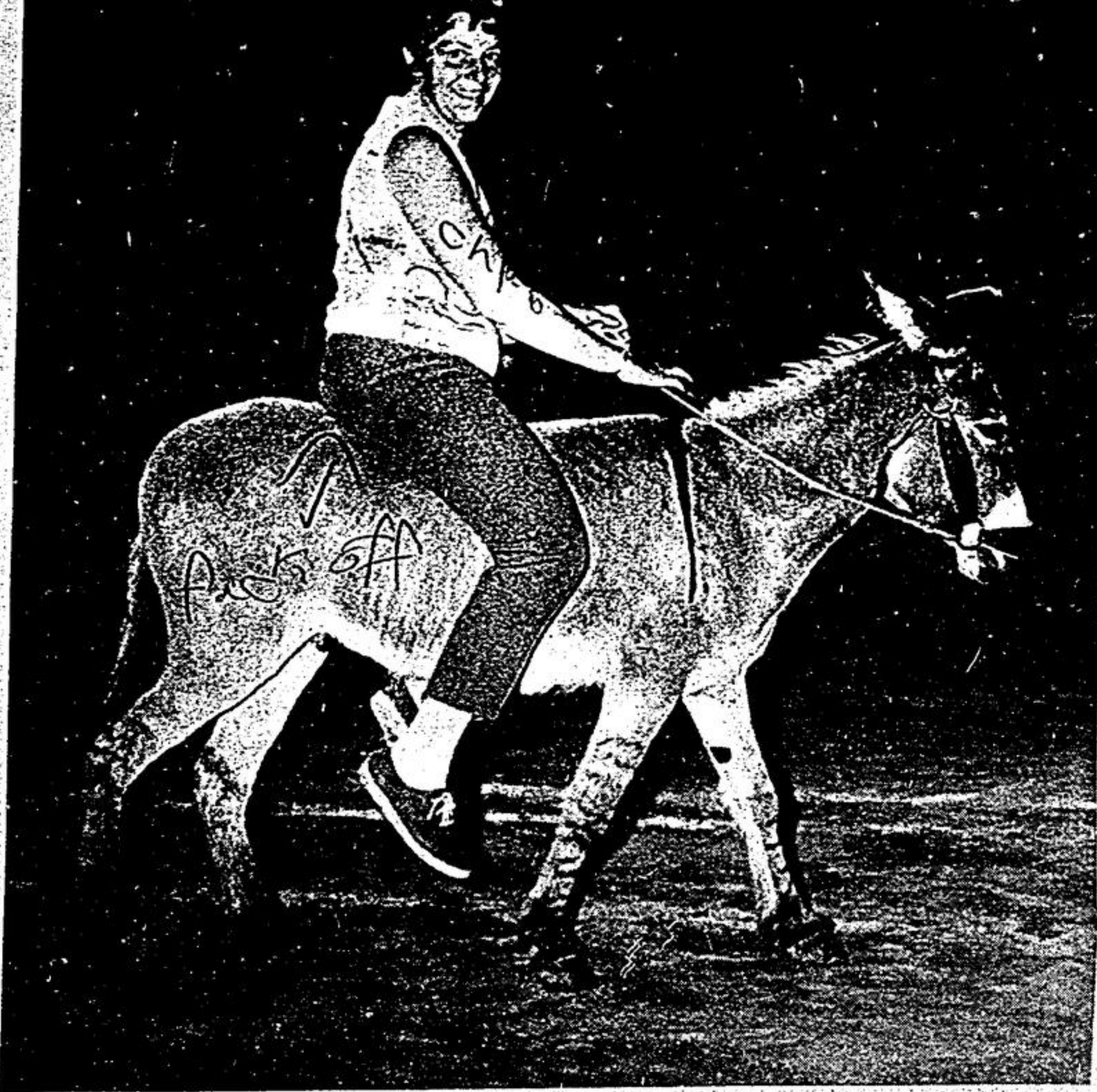
Headed for 1st and into right field