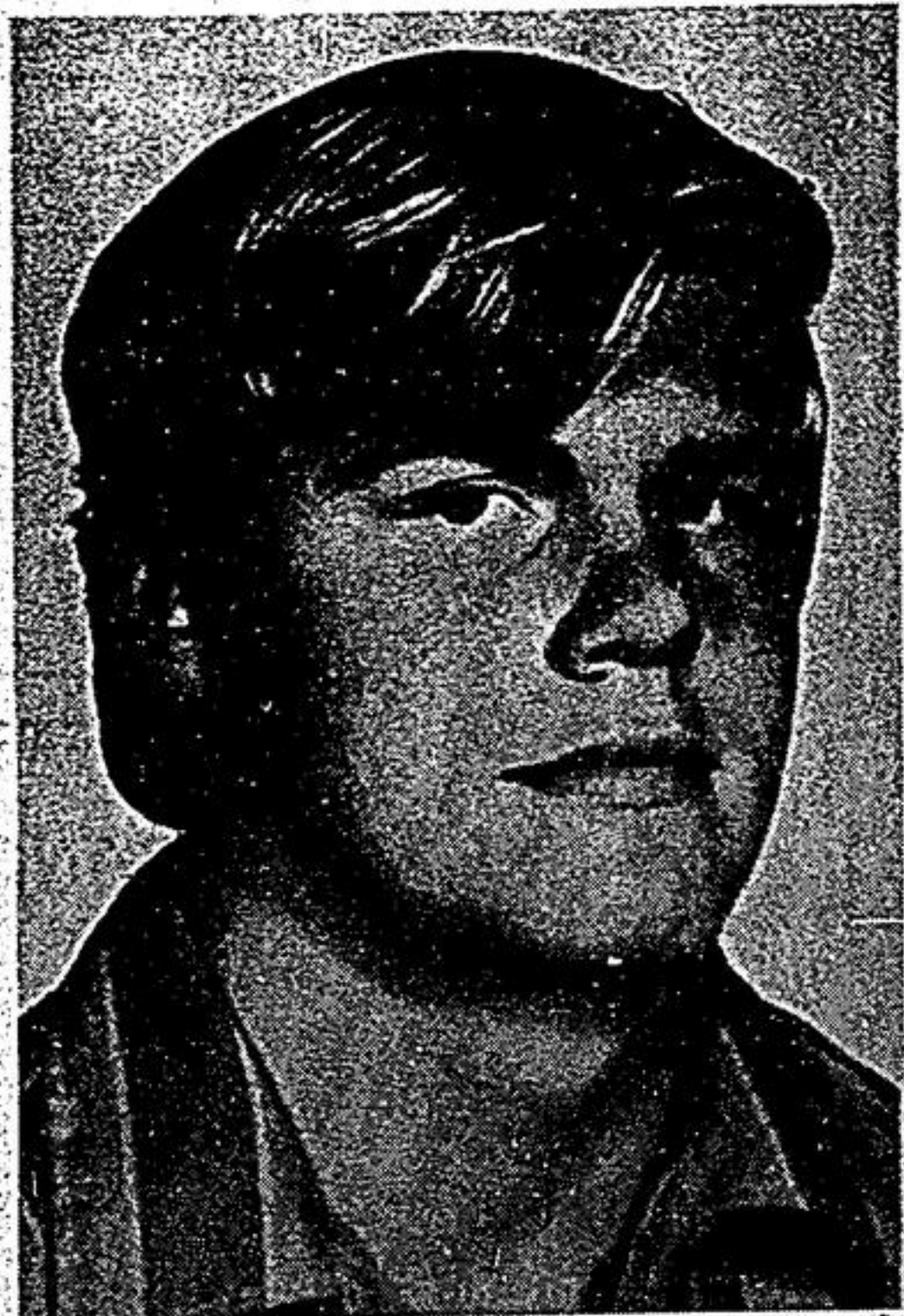
Guelph University student