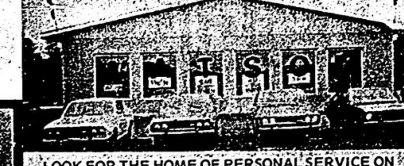
LOOK FOR THE HOME OF PERSONAL SERVICE ON HWY. 47