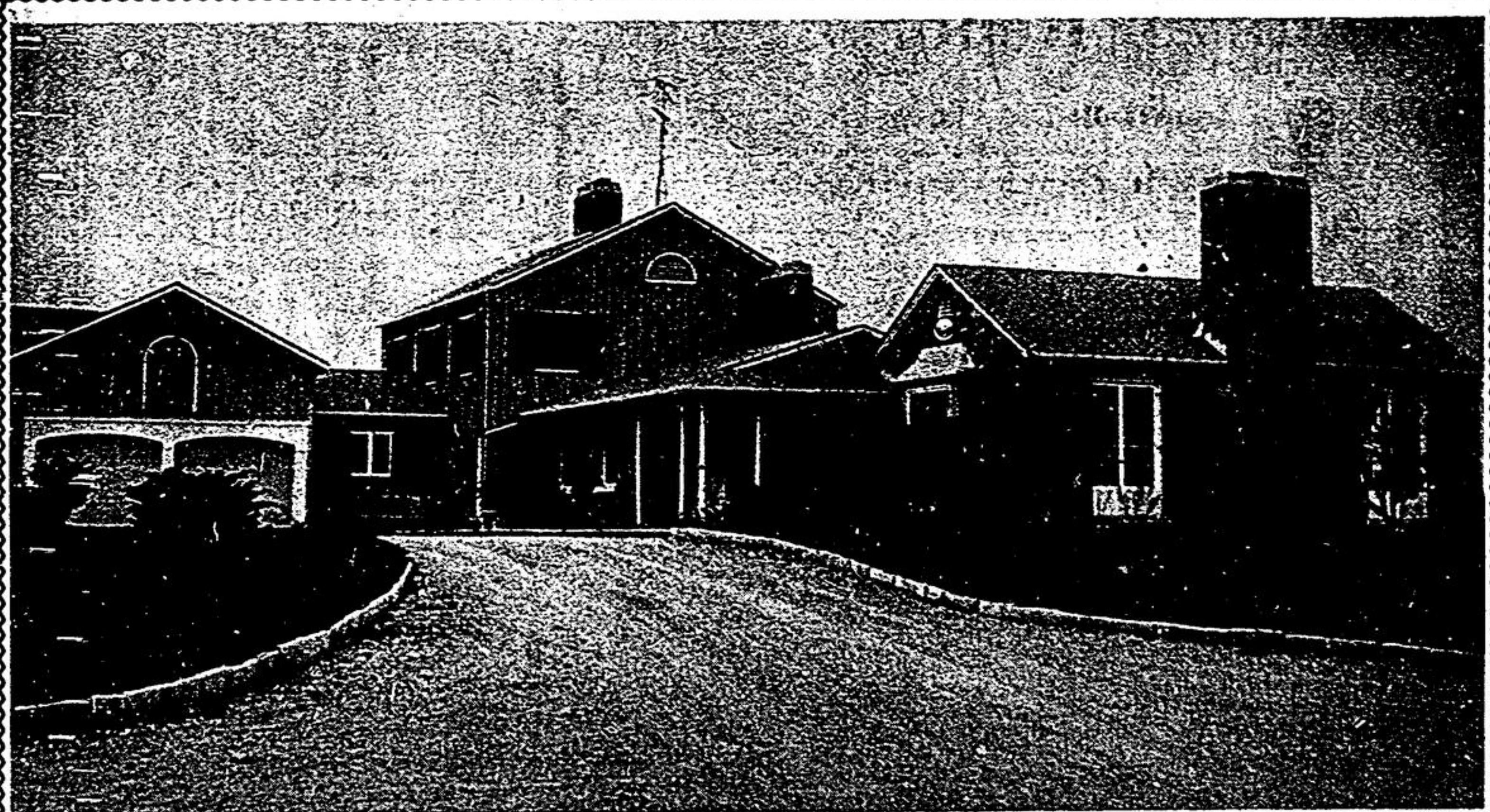
Picturesque Sixth Line residence on 'Tour of Homes' visitation list

Exhibits and skits were prepared and presented by Claremont, Whitby, Raglan, Greenwood 1 and 2; Mt. Zion, Myrtle, Ashburn, Brougham, Ajax 1 and 2; and Altona.