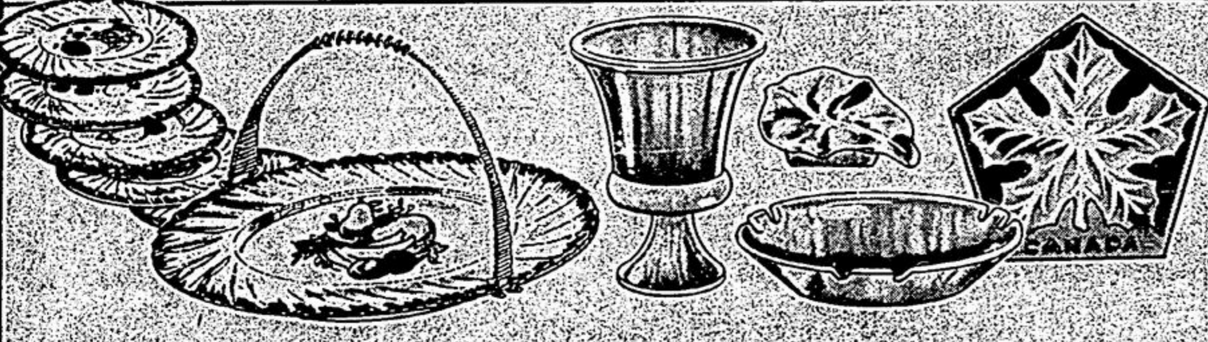
7-PIECE CAKE SET

Gold, Blue or Green 7 x 19" webbing with silver metallic thread over aluminum frame.