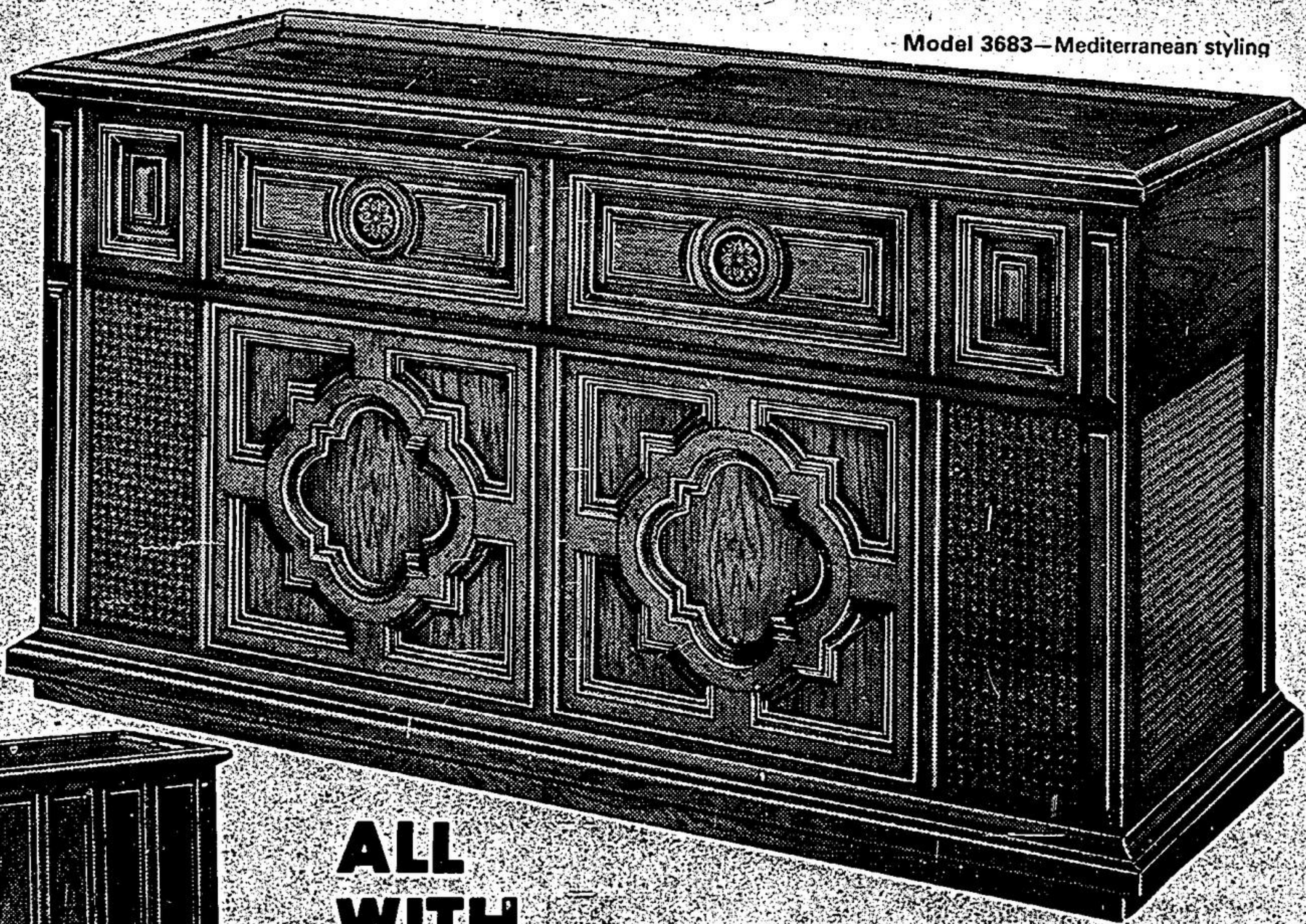
Model 3683—Mediterranean styling