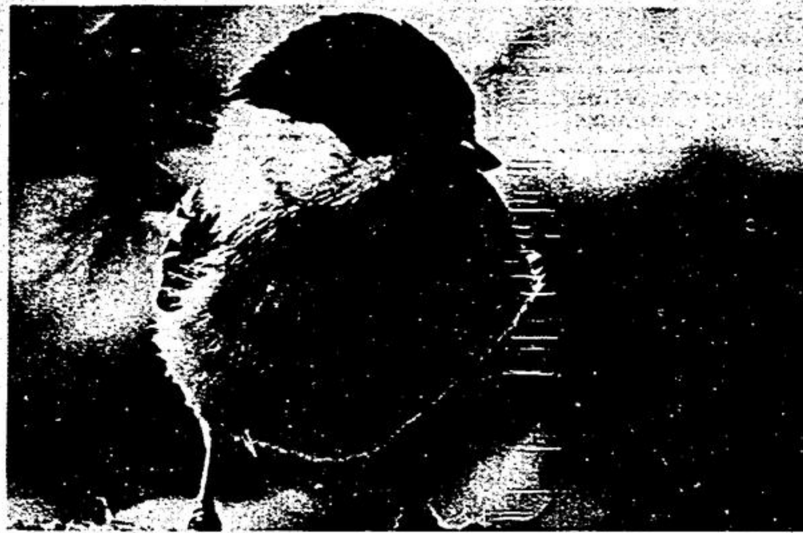
Found across southern Canada, the black-capped chickadee sings its name over and over in a friendly fashion. They thrive on sunflower seeds, peanuts and suet.