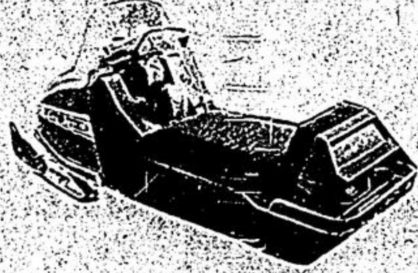
SNO-JETS FROM $625

We're Giving Free 20 lb. TURKEYS with every New or Used Car, Sno-Jet, or Boat or Motor sold between NOVEMBER 26 & DECEMBER 12.