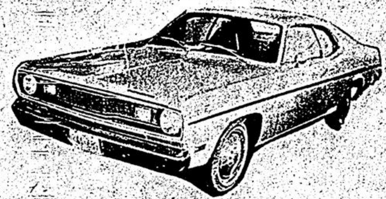
DUSTER 225 WITH BUCKETS

Emerald Isle Motors Ltd. VALIANT PLYMOUTH CHRYSLER MARINE PRODUCTS 33 MAIN ST. W. - STOUFFVILLE Telephone 640-2400