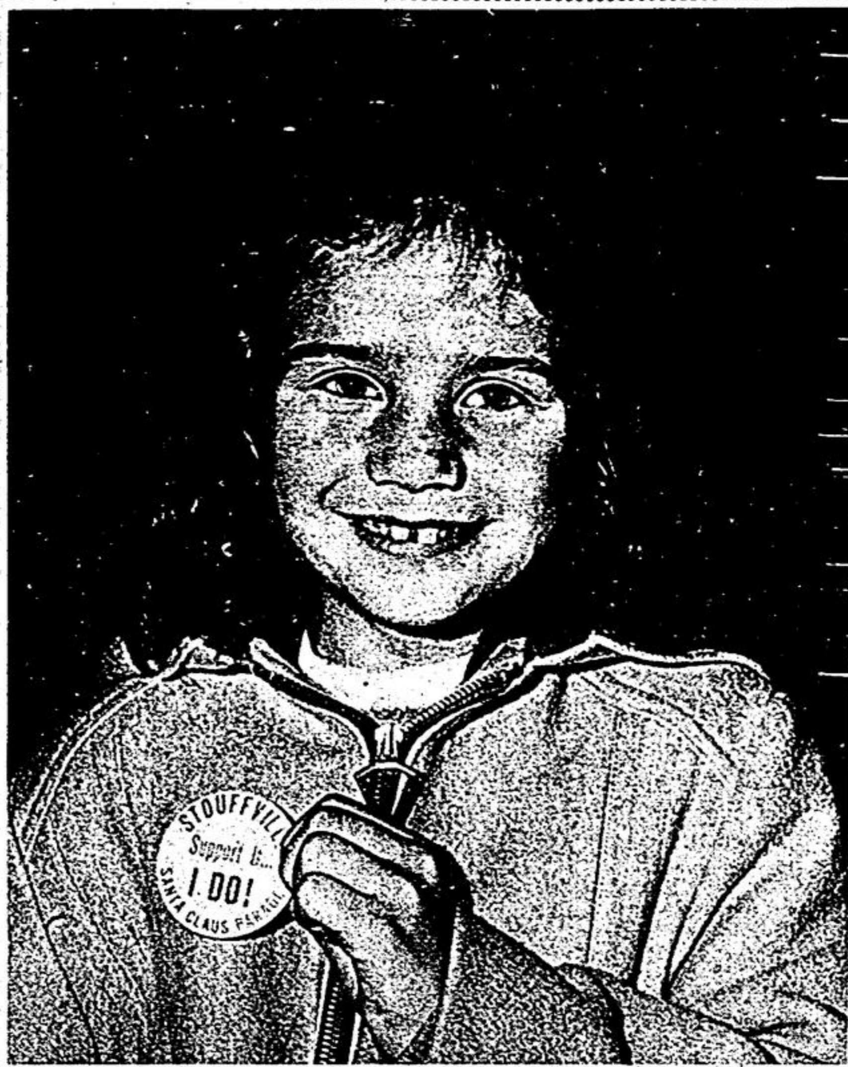
Christmas parade booster