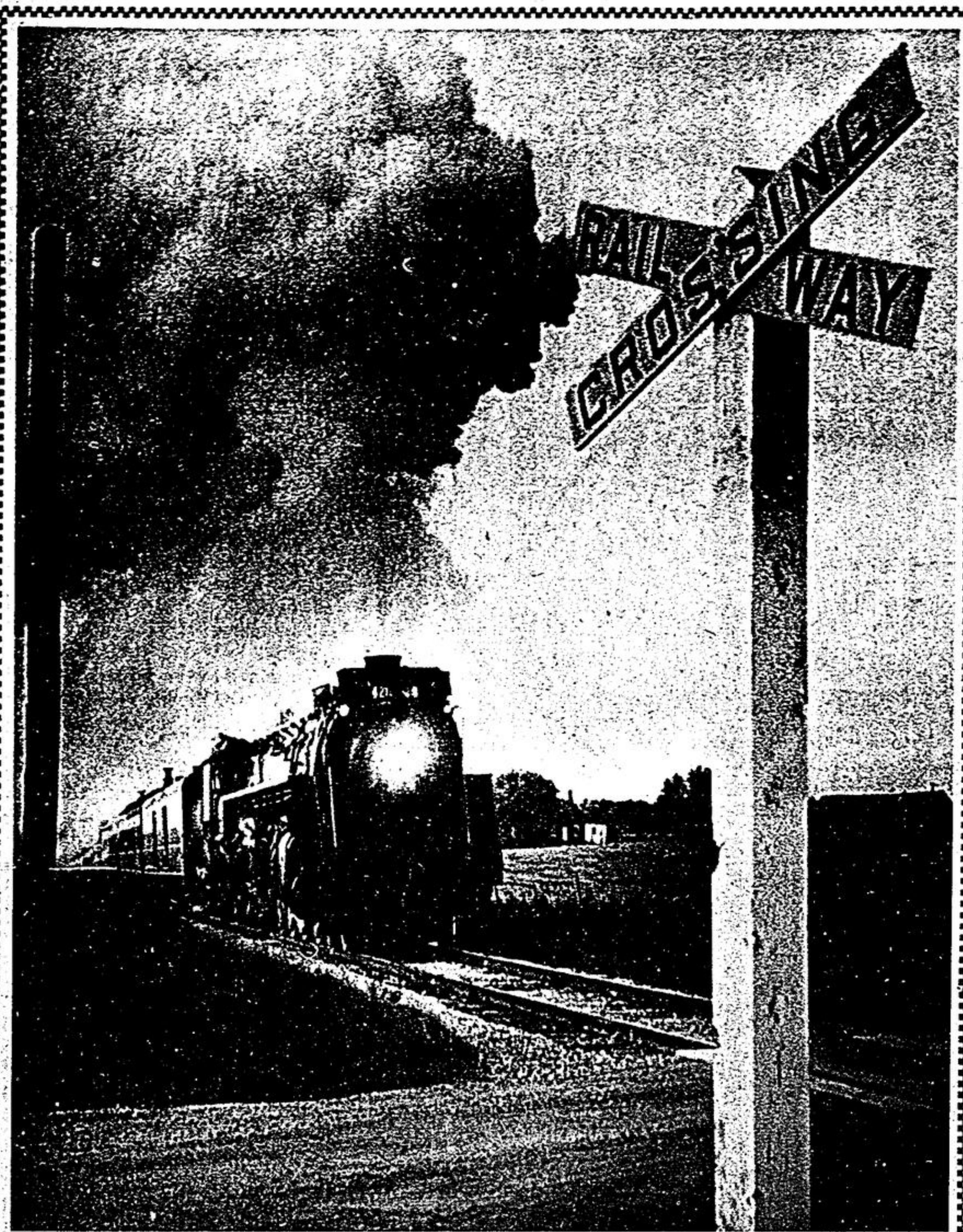
No. 6218, a steam-powered spectacle

A magnificent sight-belching huge clouds of smoke and steam. No. 6218 roared through Stouffville, Saturday, to the welcoming waves of