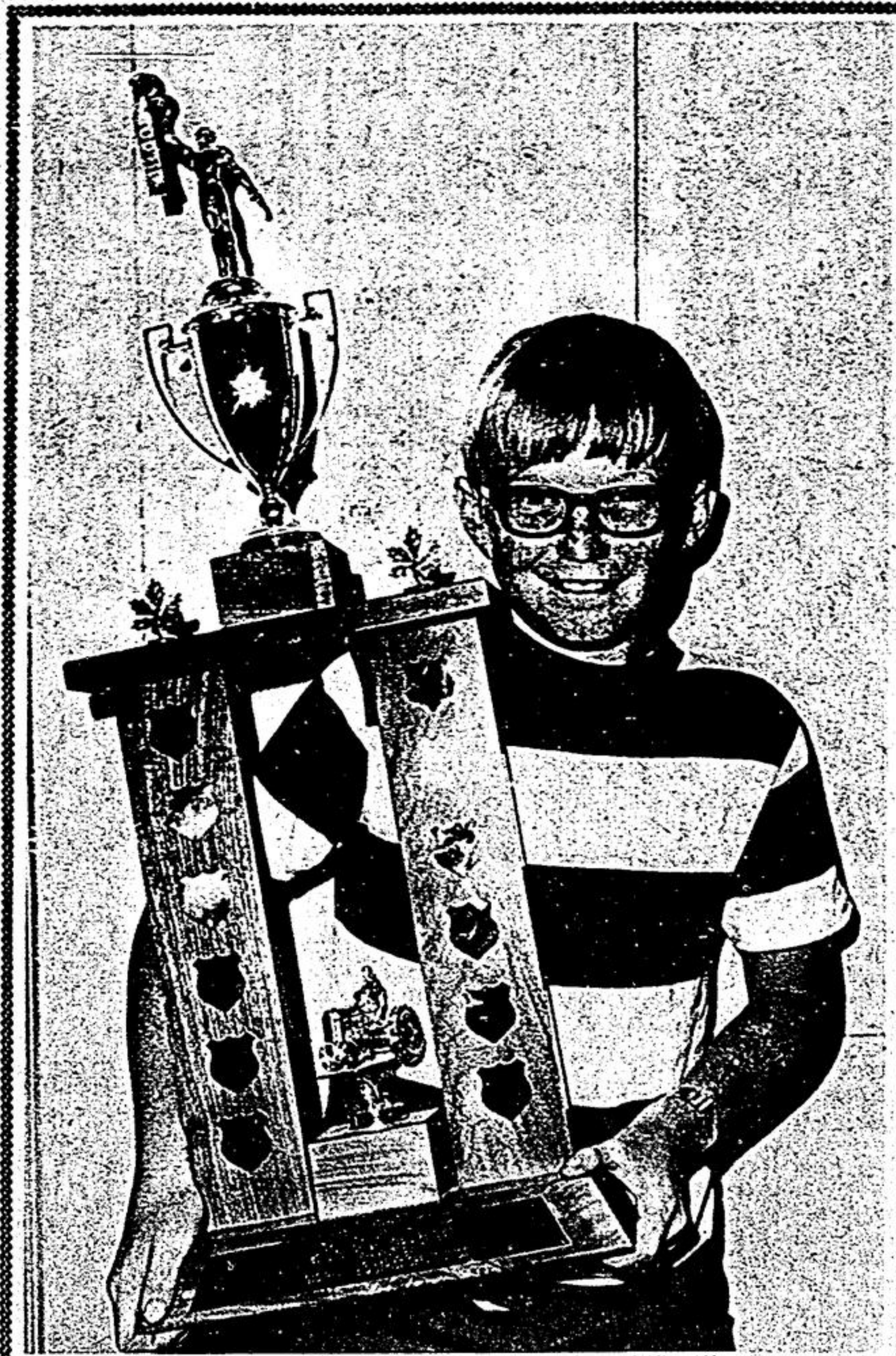
Smallest plowboy - largest trophy