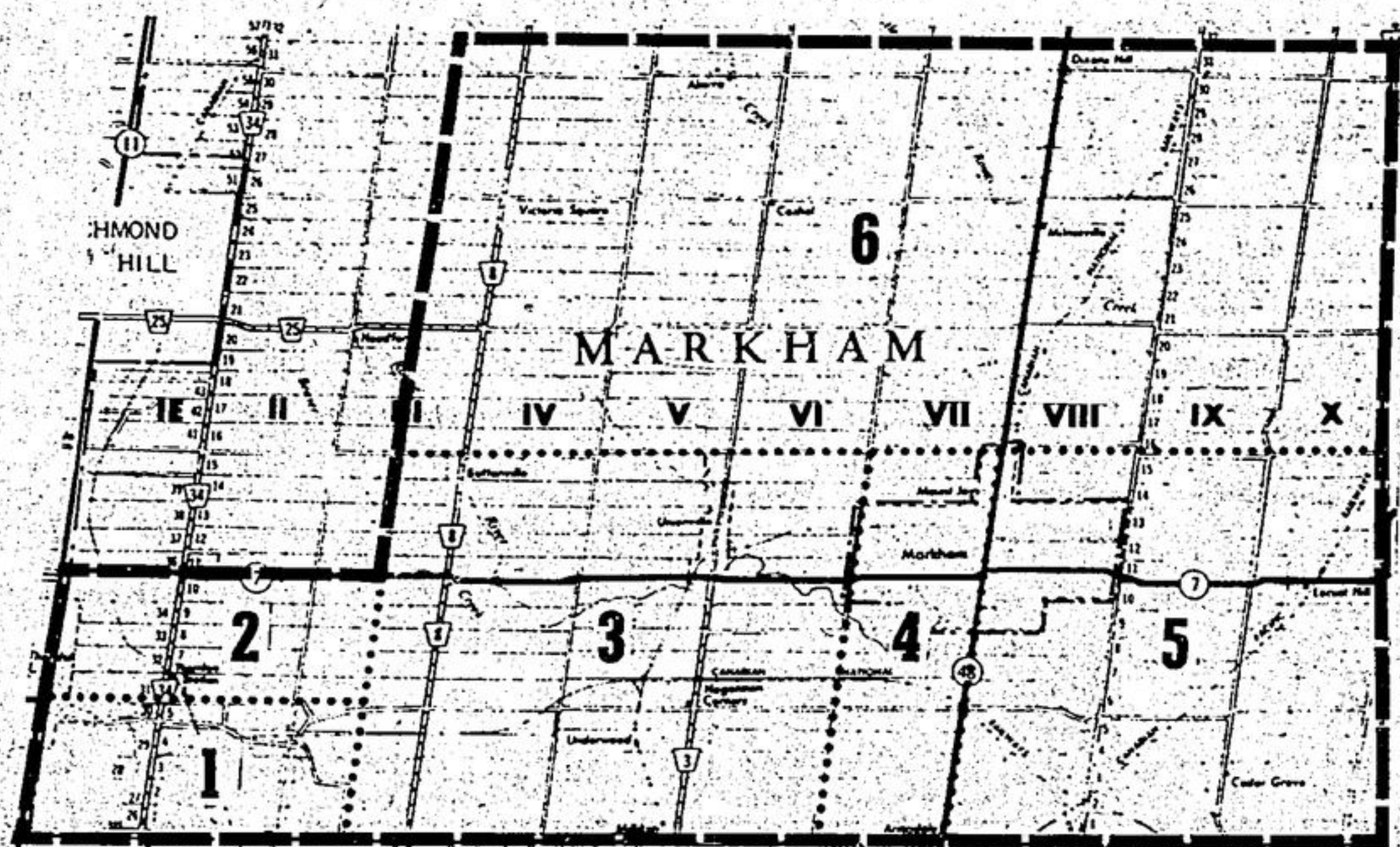
The Town of Markham Area is divided into six wards, extending from Mongolia to Thornhill. The Area has 17,500 eligible voters. Election date is Monday, Oct. 5.