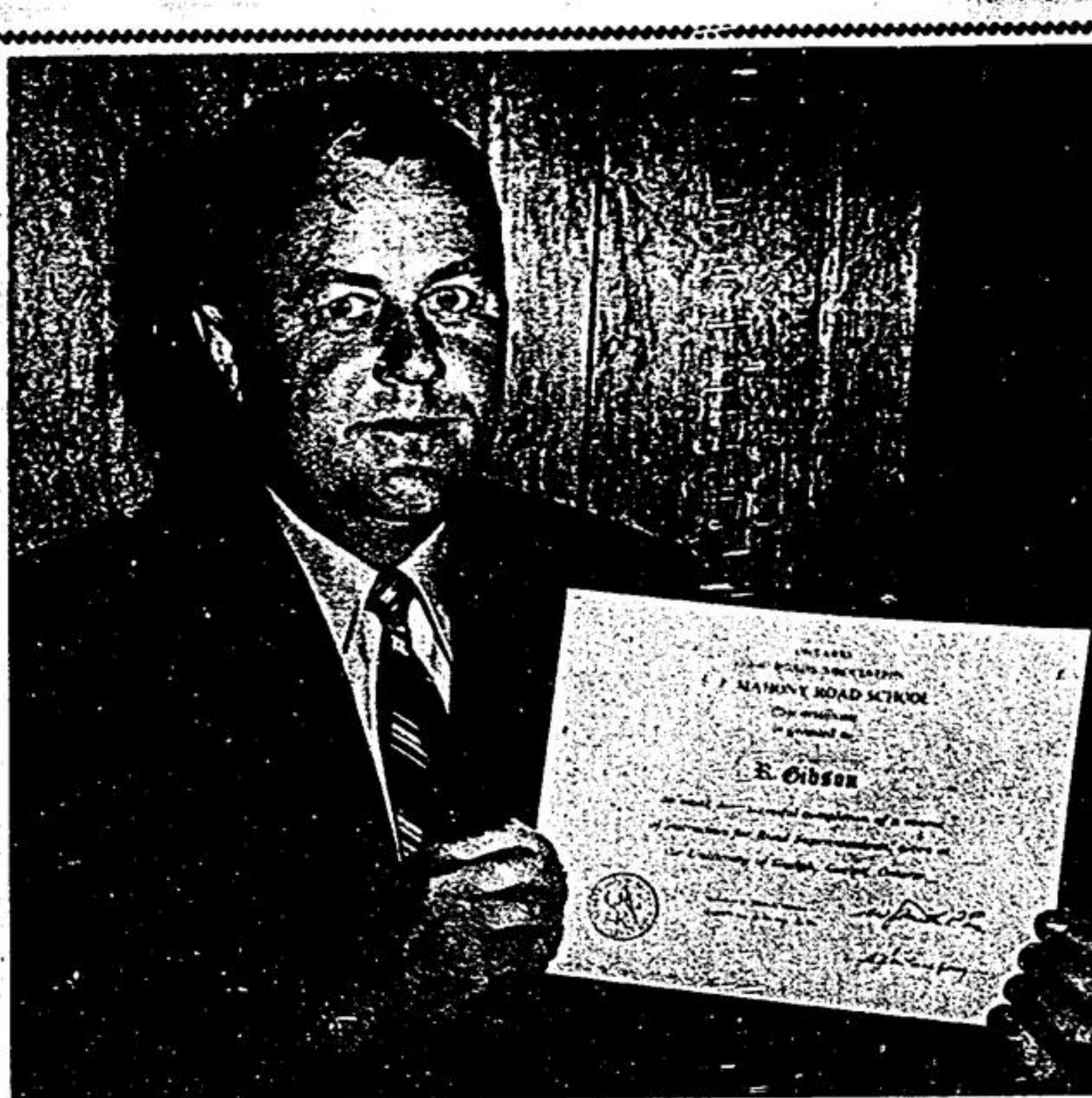
Road superintendent completes course