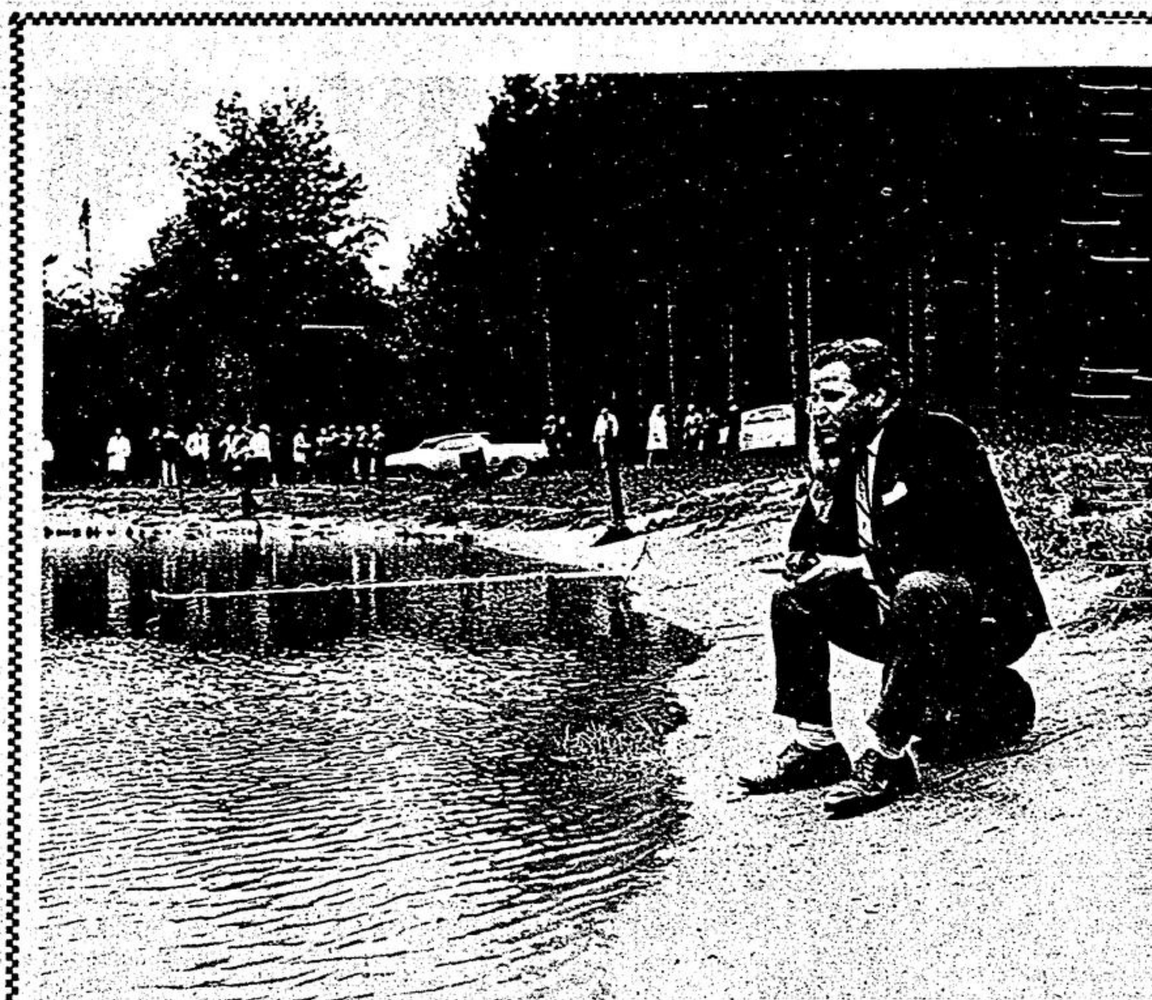
A fishing pole and a quiet pond - where problems disappear