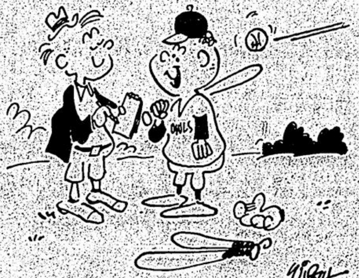
"We'll play a heads-up game this year!"