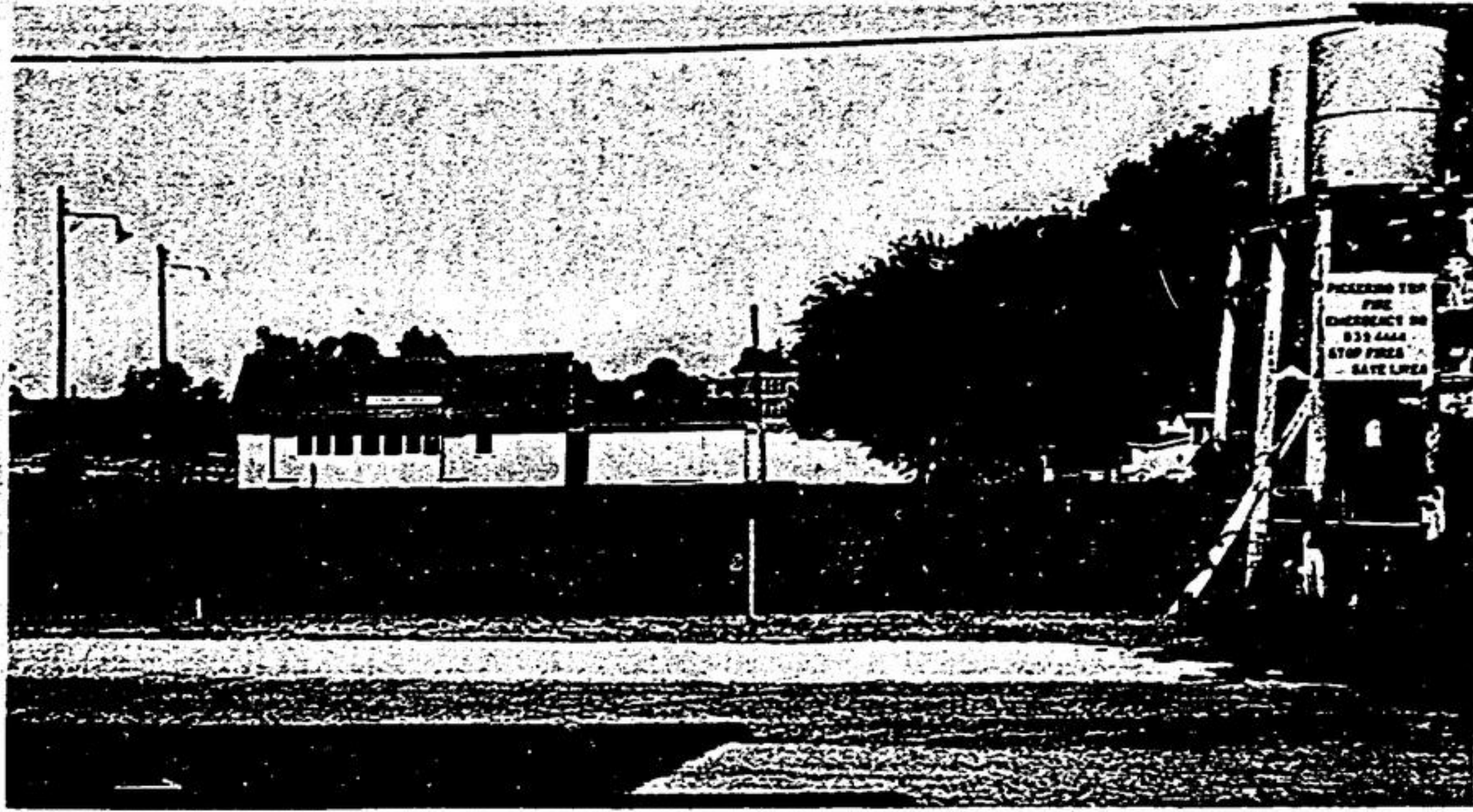
The Claremont Lawn Bowling Club has commenced its activities for another season. The premises has been recently renovated and the greens are in excellent shape.