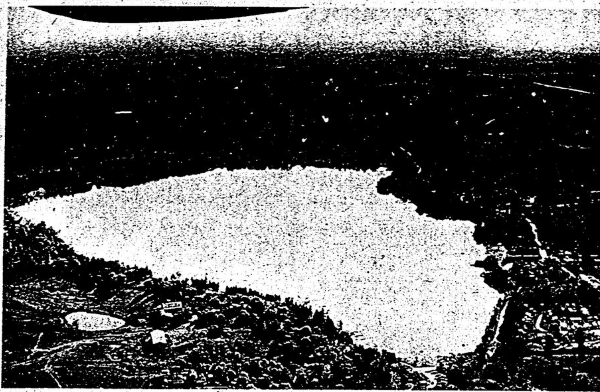
Musselman's Lake from 1,000 feet up