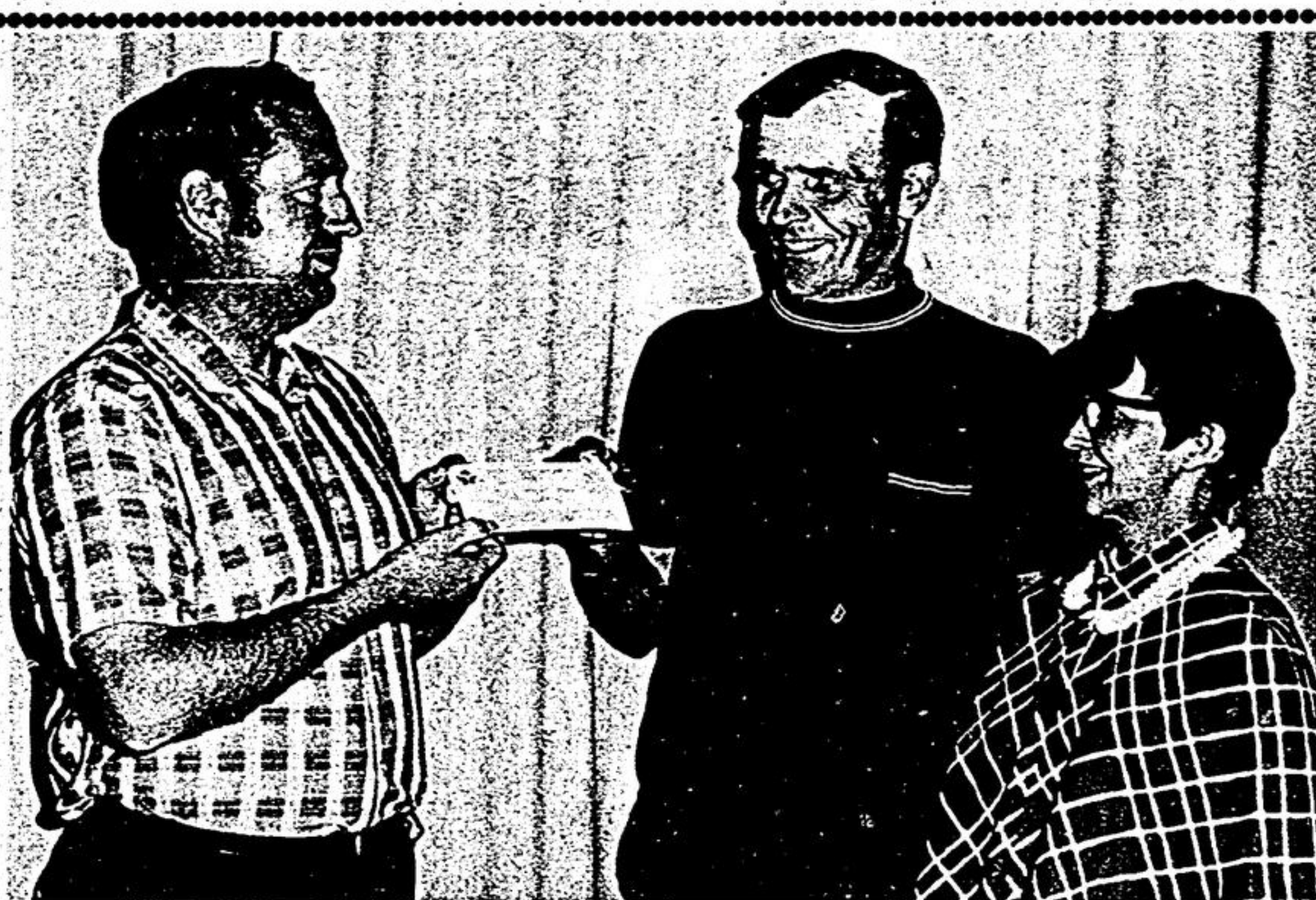
Stouffville recreation receives $1,150