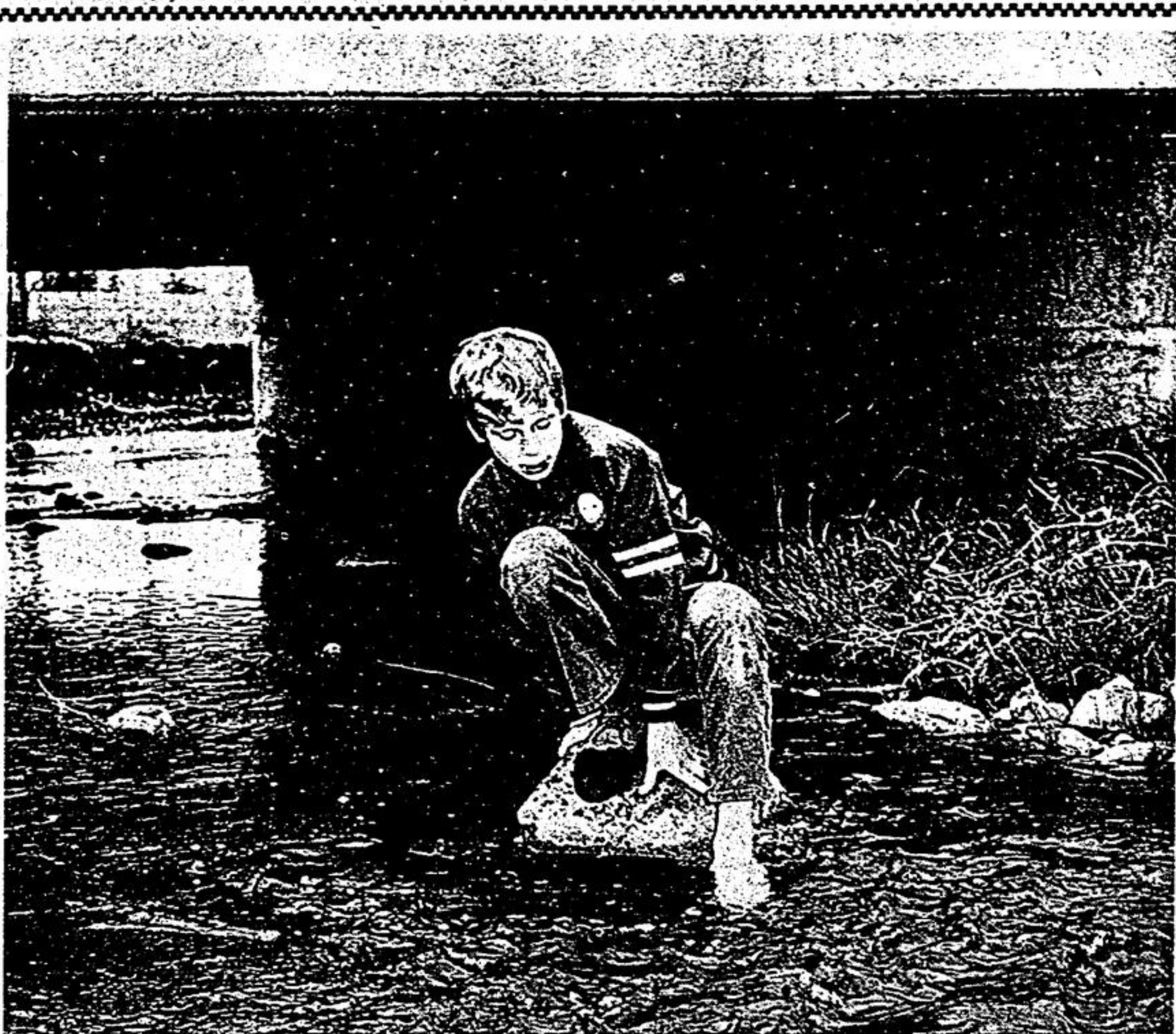
For marathon walker — the pause that refreshes

VANDORF — To enable the staff to move back into the newly renovated offices, the Whitchurch municipal building at Vandorf will be closed for business, Tuesday June 2. The co-operation of ratepayers is requested in this regard. Interior repairs were necessary following a fire, May 1, that caused over $9,000 damage.