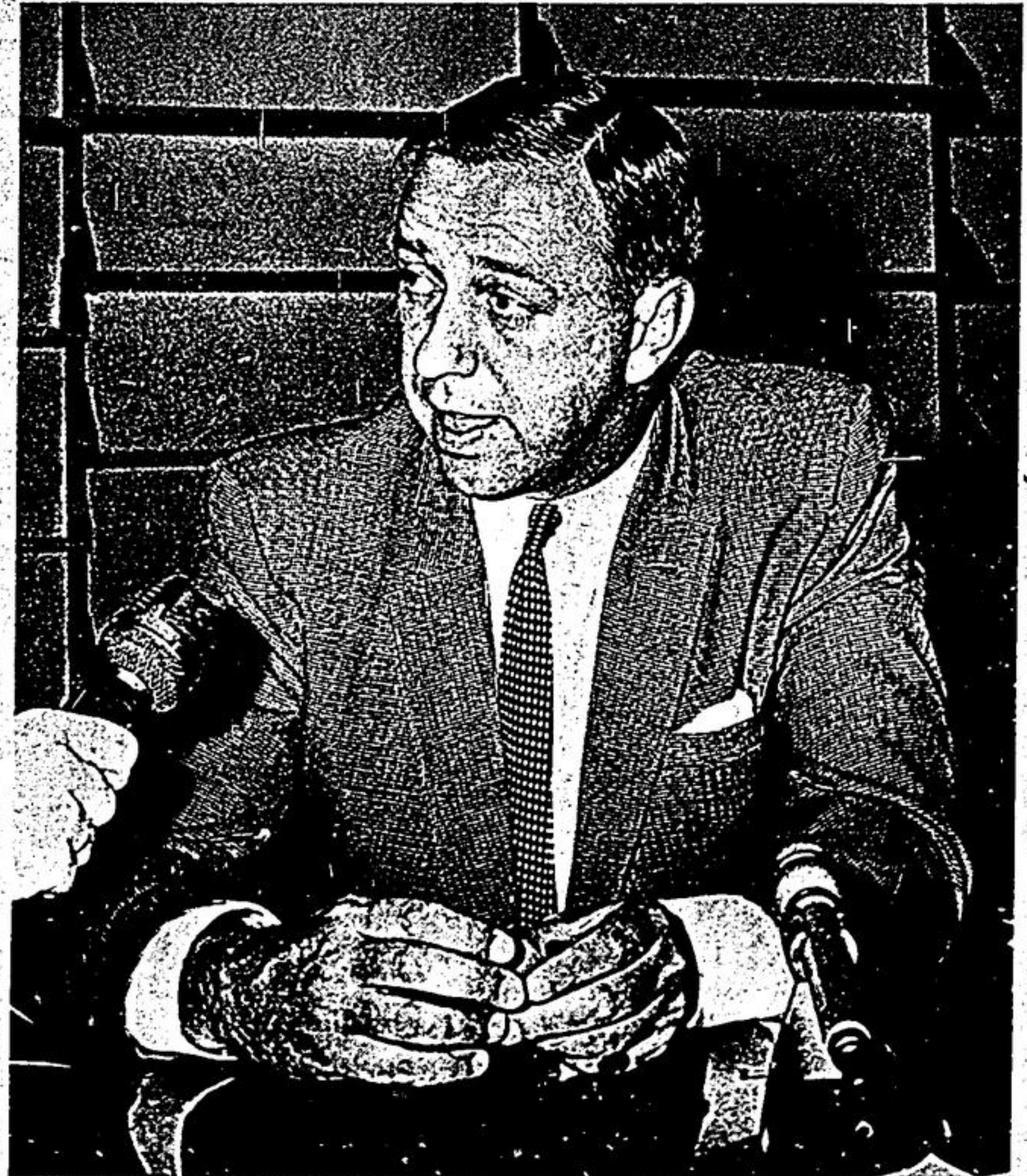
The creator of Regional Government for York, Hon. Darcy McKeough. Following his announcement, May 6, he held a conference with press representatives at Bayview Secondary School.