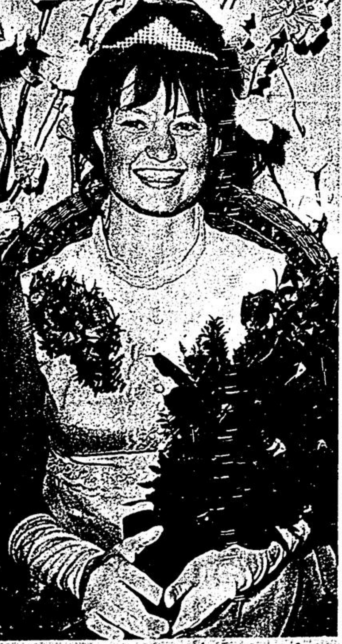
A proud and happy moment — the student 'queen' of Stouffville High.