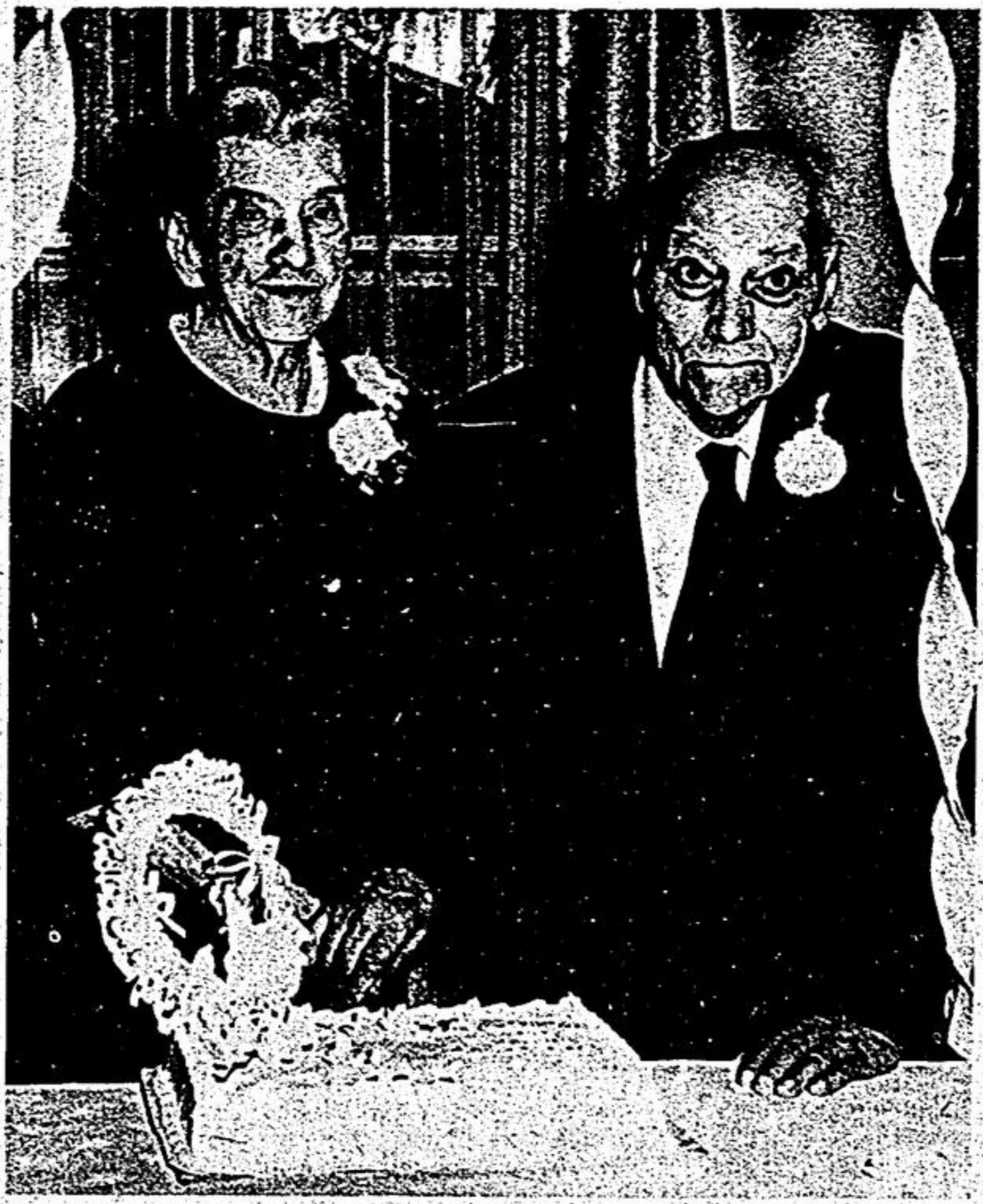
Gormley couple married 62 years