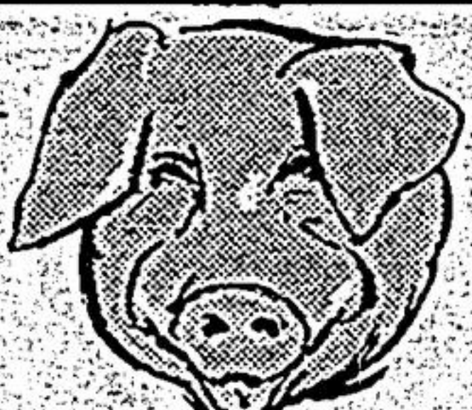
USE THE CO-OP FEED PROGRAM FOR HOGS