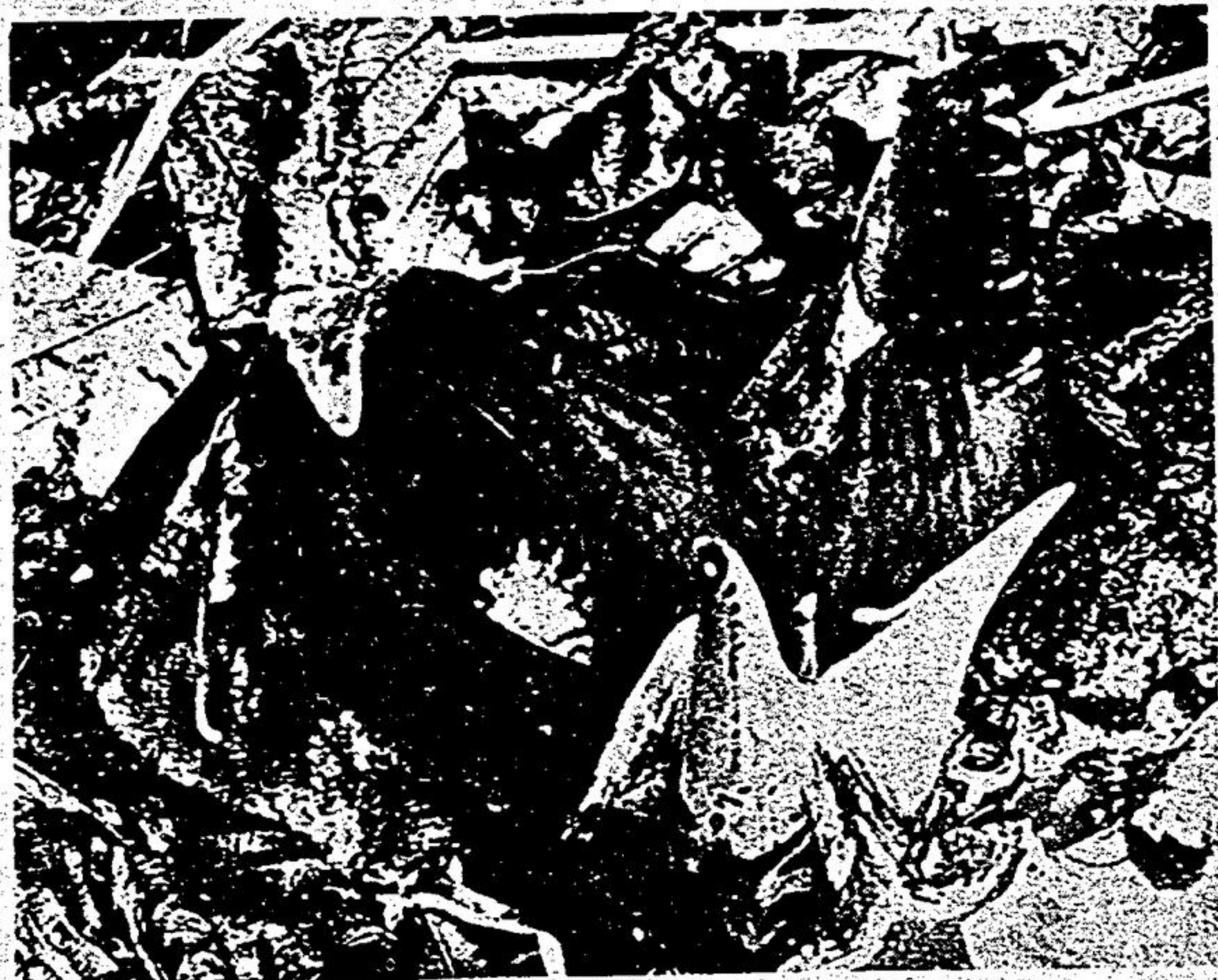
Thrusting it way through ice and snow, skunk cabbage is our earliest spring wild flower. —B. Pegg.

Edge and Betty Pegg During the month of February, though the ground may be covered with snow and the cold blasts of winter be still upon us, a most extraordinary flower of the swamp land prepares to bloom.