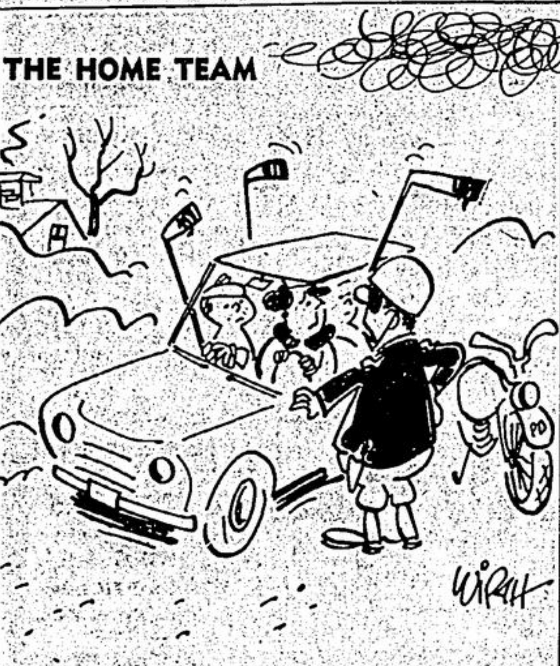
"They'll have to keep 'em inside or I'll ticket you for high sticking!"