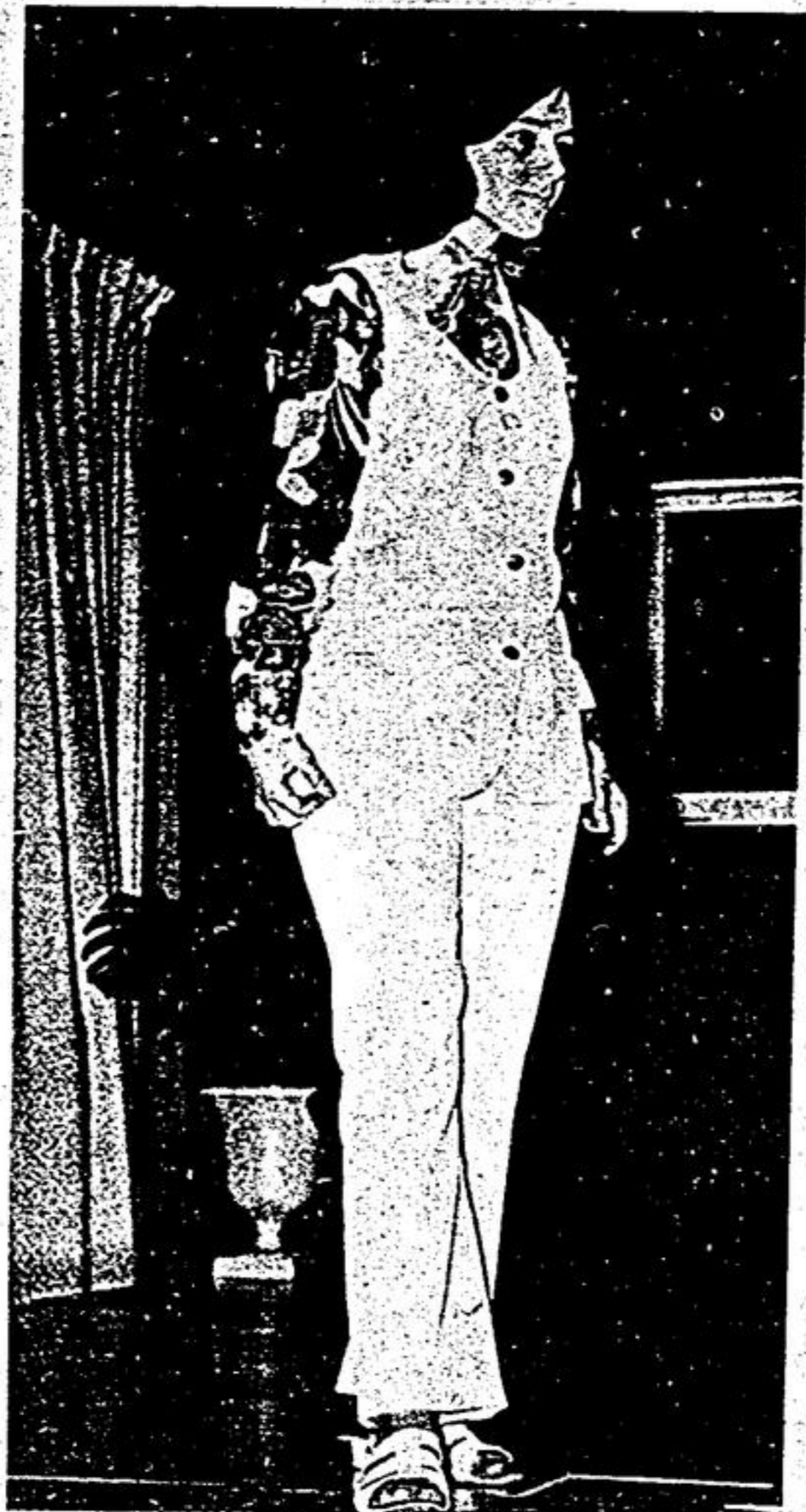
Fashion show attracts large audience

There's no show like a fashion show, particularly when the participants are local ladies and girls. On March 4, Paul's Dry Goods of Stouffville presented "Prelude to Spring", sponsored by Christ Church