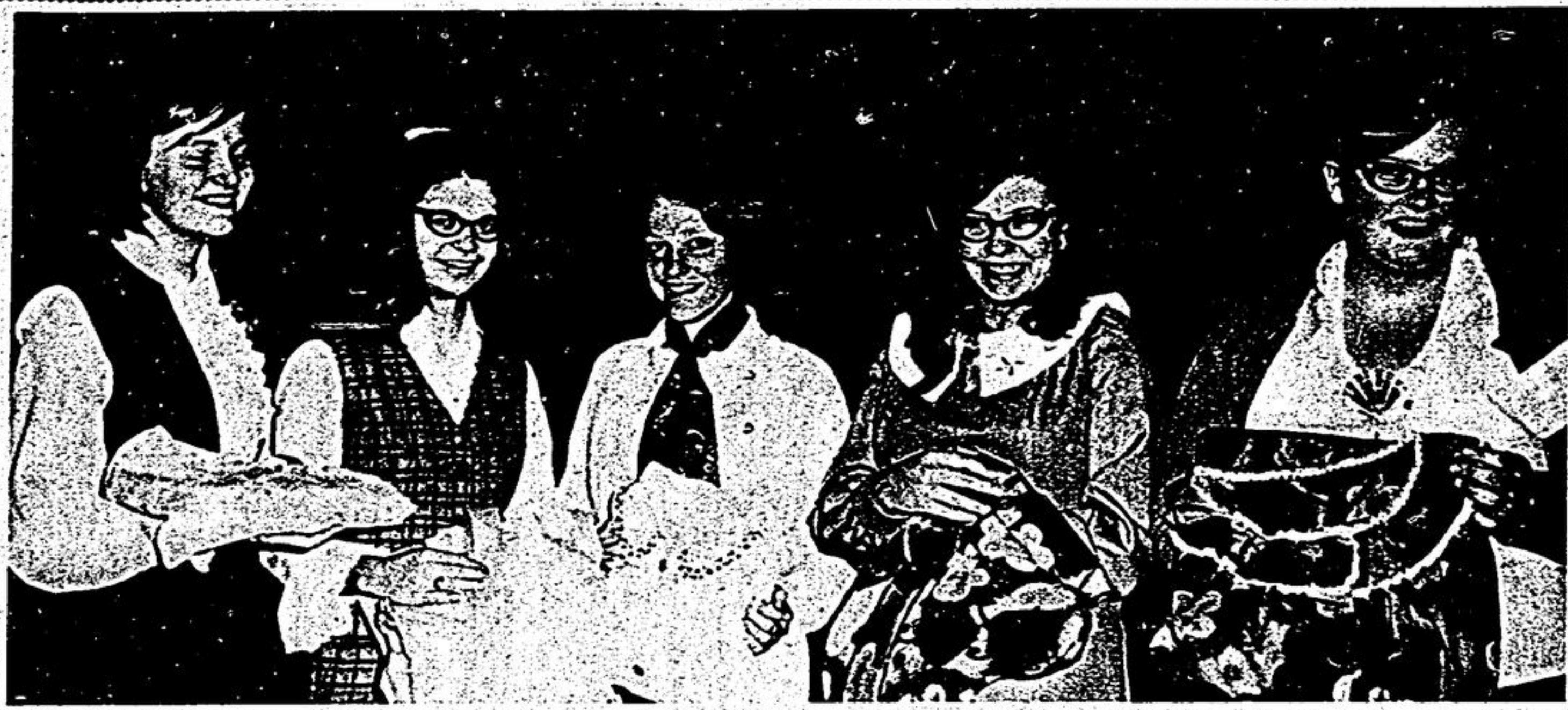
Brougham 4-H Club girls receive county honors