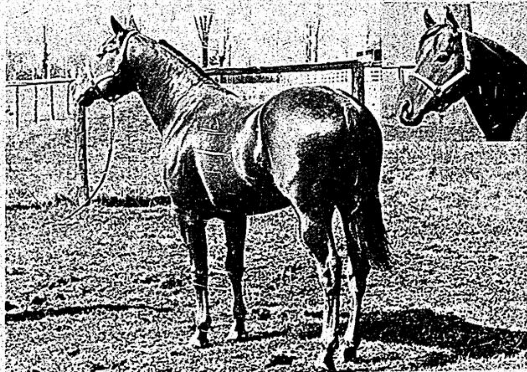
JET AWAY BARS 241373

He was the leading sire in the American Quarter Horse Association of Performance Contest Winners in the years of 1966-65-63-62 and 1959, second in 1968-67-64-61 and 1960, third through the years of 1951-52-53-54 and 1955. King is the leading sire of Show Register of Merit Qualifiers and second leading sire of AQHA Champions. King's daughters have produced 497 foals with show or race records, including 33 AQHA Champions, 112 show ROM and 57 Race ROM. Four of his daughters are on the leading brood mare list, and one is the all-time producer of ROM Qualifiers. BOOKED FULL FOR 1970 — BOOK NOW FOR 1971