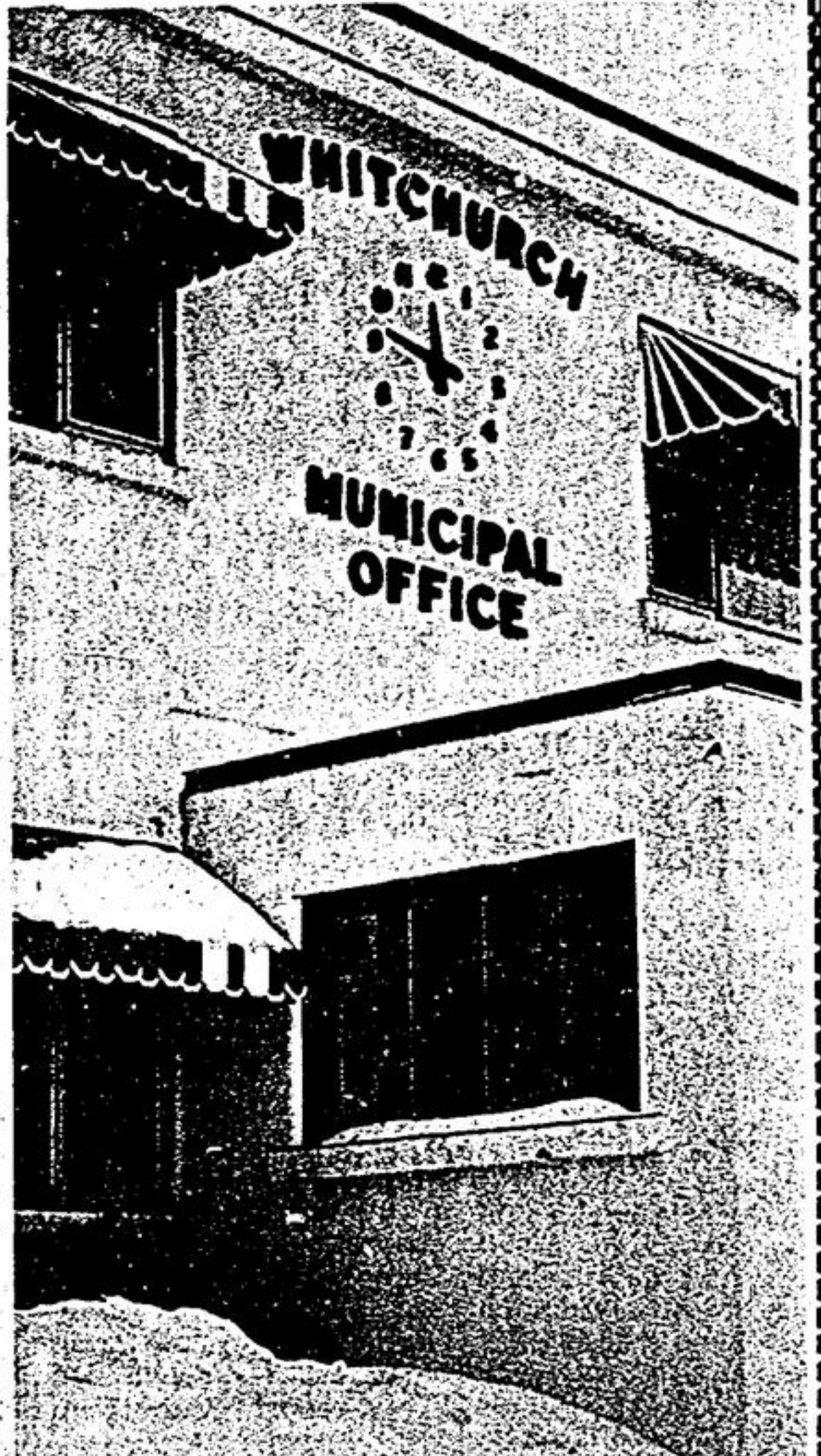
The commuters' timepiece, a clock on the Whitchurch municipal building.