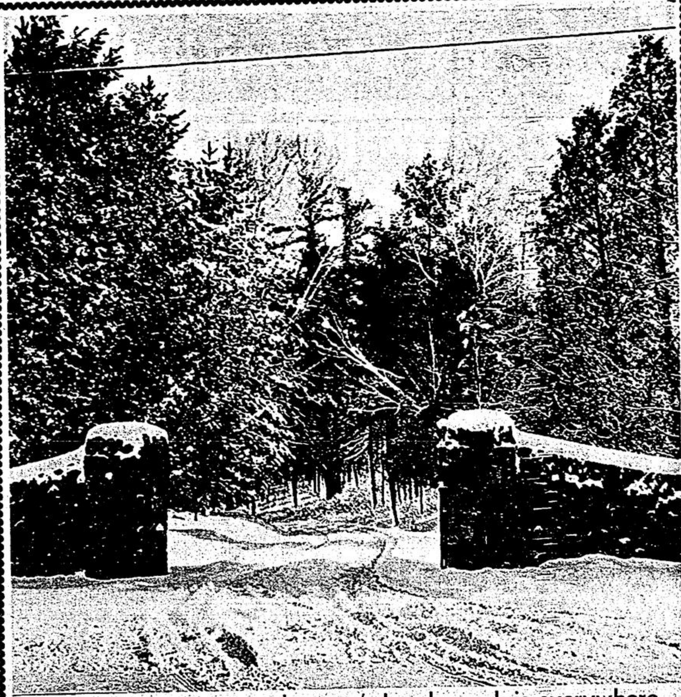
The winter season and nature's handy work is everywhere

Prizes, donated by local businessmen, were given for draws, spot dances,