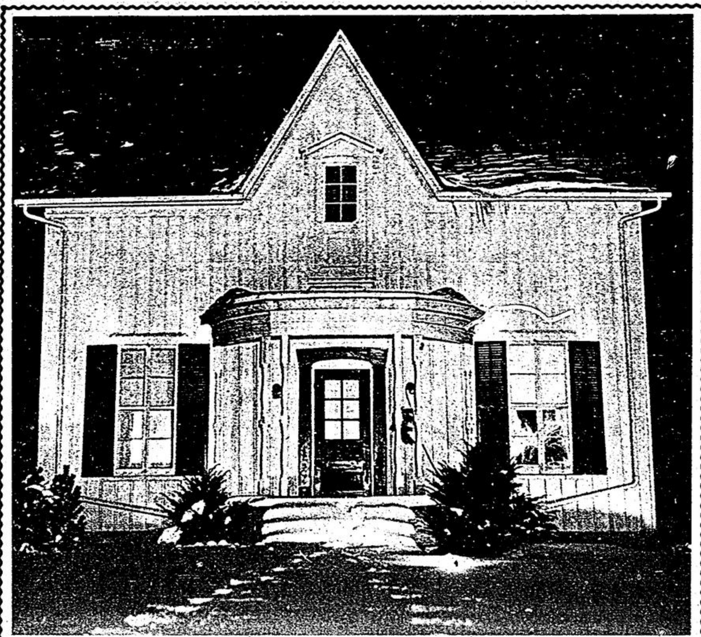
Country home is all aglow for Christmas