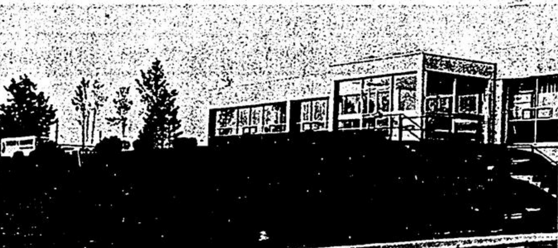
The Sinclair & Valentine building at Dufferin and Finch Sts. in Toronto illustrates how Revenue Properties combines attractive architecture and landscaping to provide a pleasant working environment.