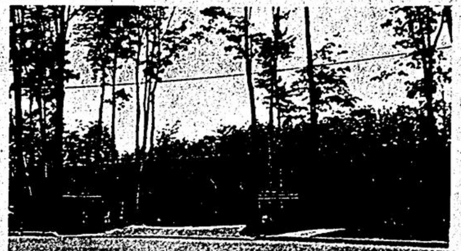
Union Carbide Canada Limited and the Centennial Centre of Science and Technology are two of the tenants in the multiple tenancy complex on Prince Arthur Place.