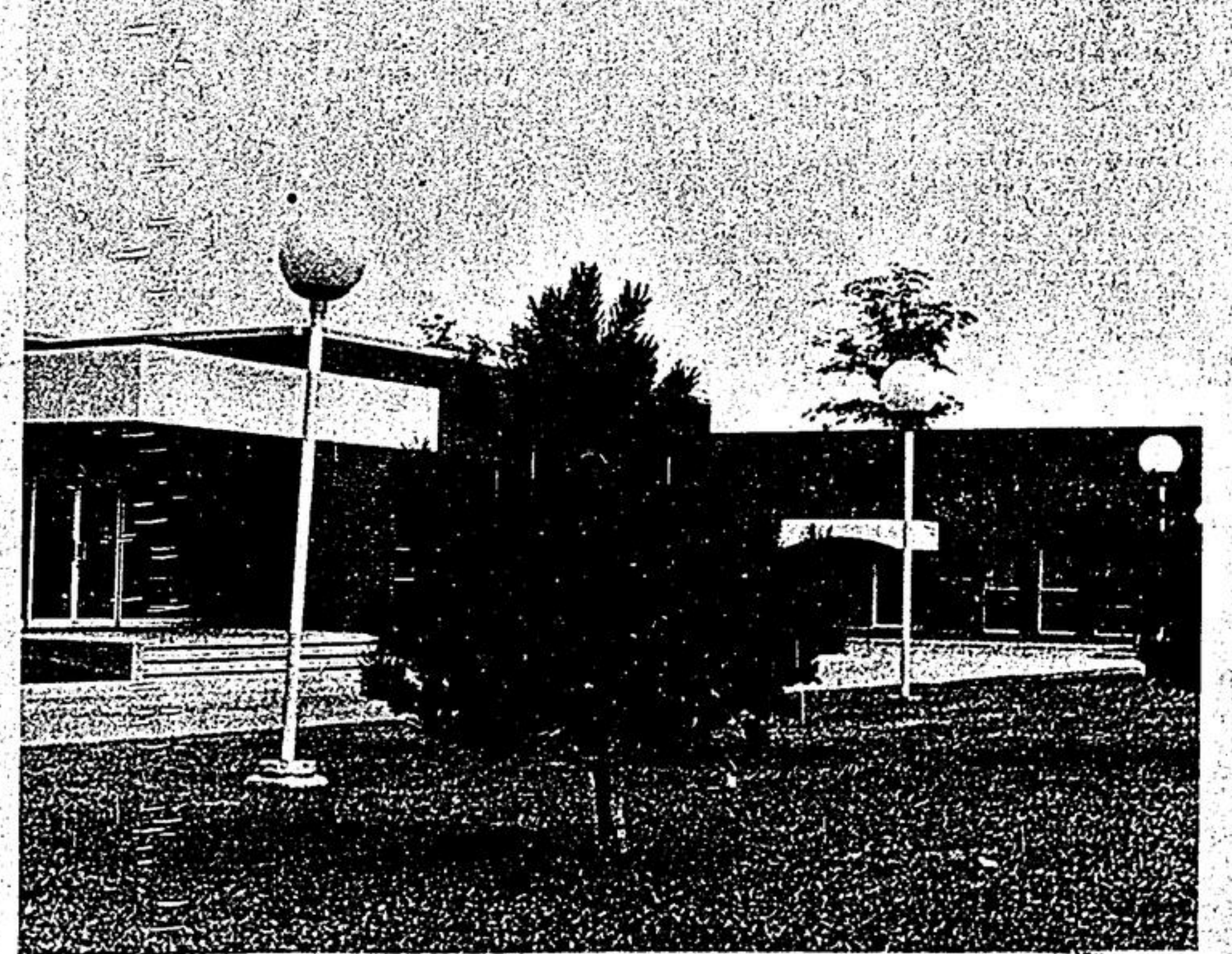
Wrentham Court located on Leslie St. in Metropolitan Toronto is a multiple tenancy building, with office area fronting the court and warehouse and loading platforms at the rear.

They include: Anaconda American Brass Canadian Industries Limited Canadian Motorola Electronics Company DuPont of Canada Falconbridge Nickel Limited Peugeot of Canada Limited Prentice-Hall of Canada Limited Westlox Canada Limited Xerox of Canada Limited