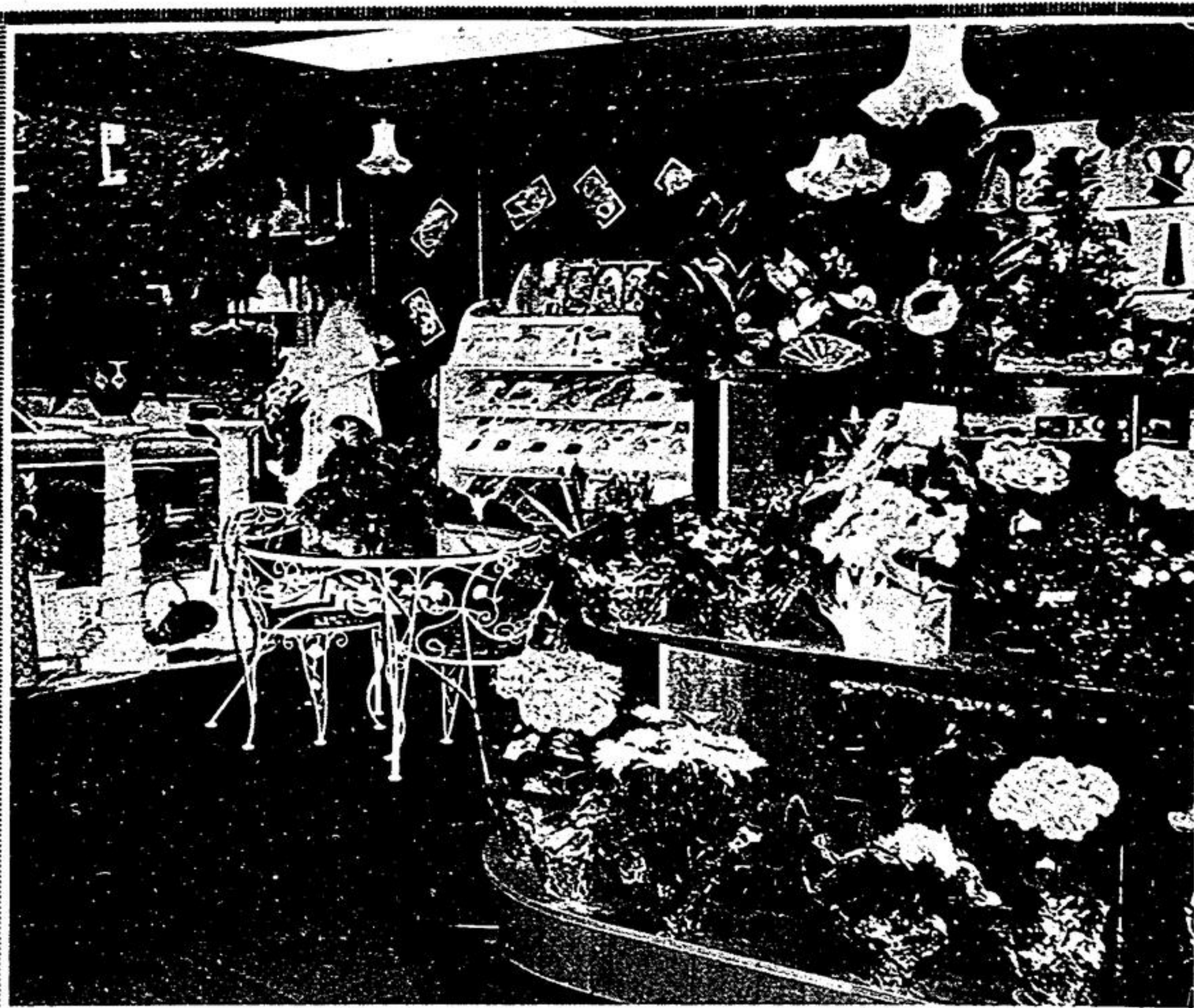
Enlarged interior, Hudson Floral Shop, Main Street The interior of Hudson's Floral Shop on Main Street has been beautifully enlarged. A portion of the new section is shown here. Over the Easter weekend, sales of 500 individual orders were completed.