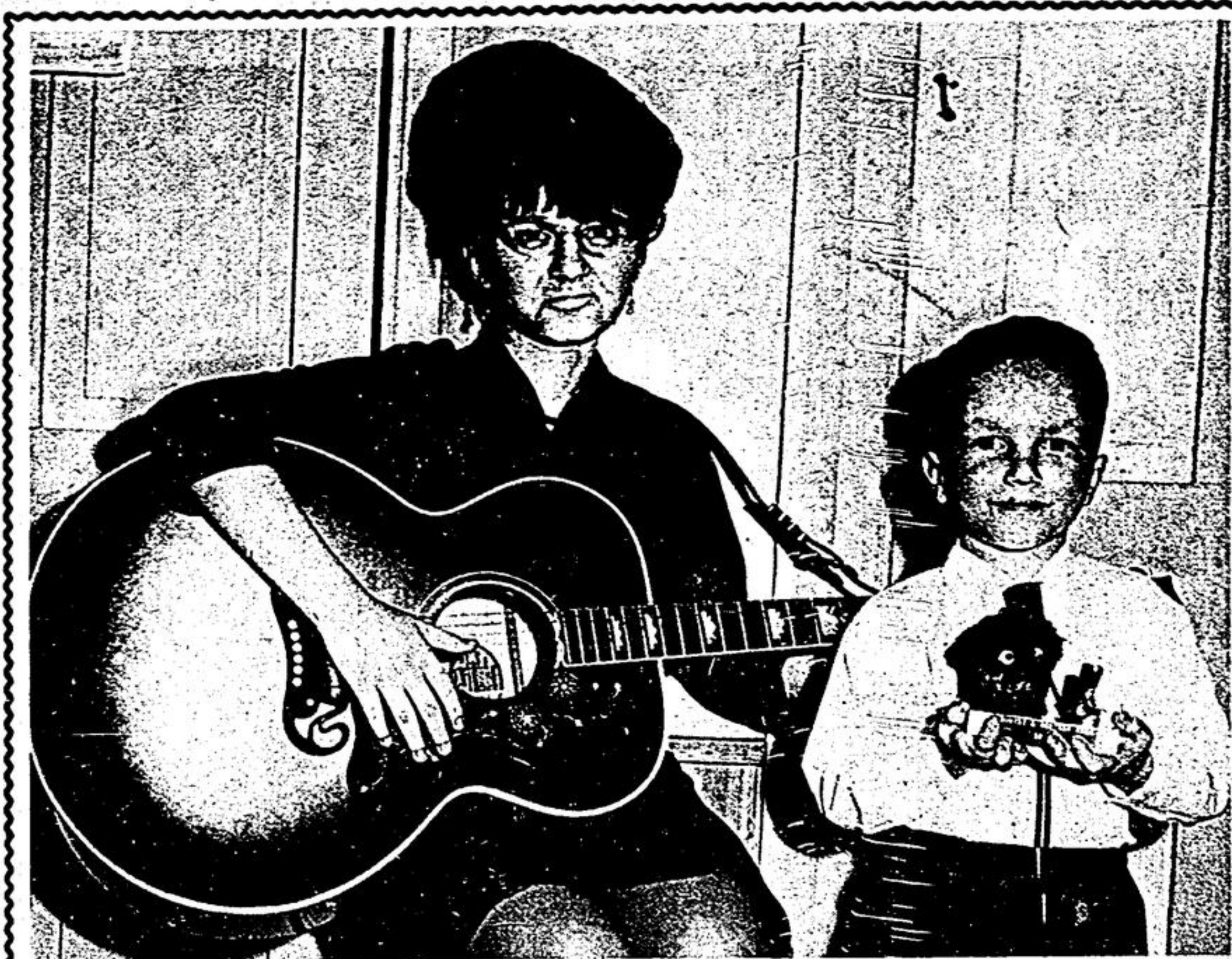
Brother and sister duet wins awards