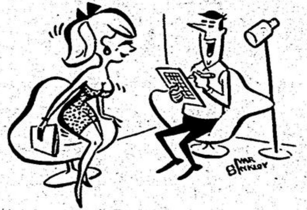
"Best place to shop for Easter Gifts, with 7 letters . . . 'HOUSTON'"