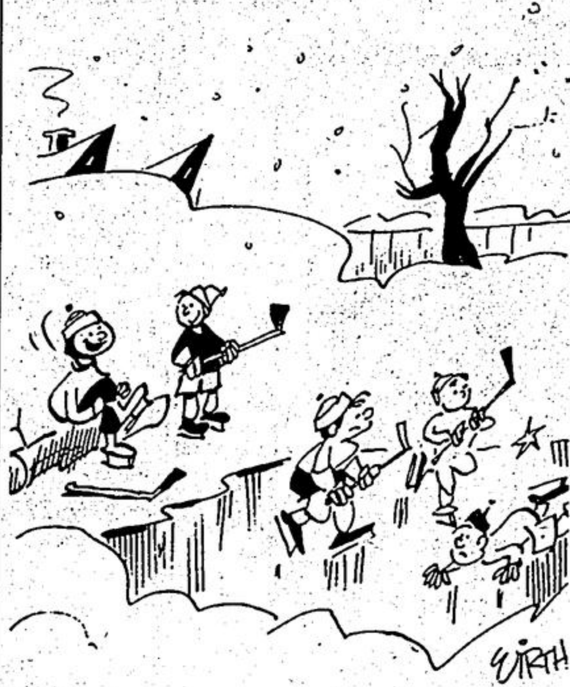
"I had to break a few cups before mom realized I shouldn't dry the dishes!"