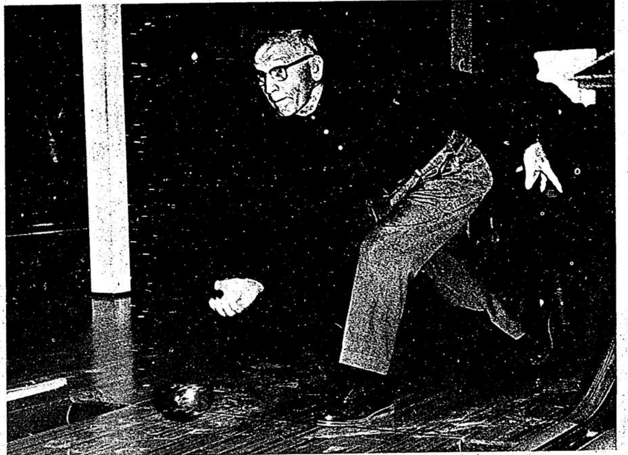
'The Senators' bowling league where age is no barrier