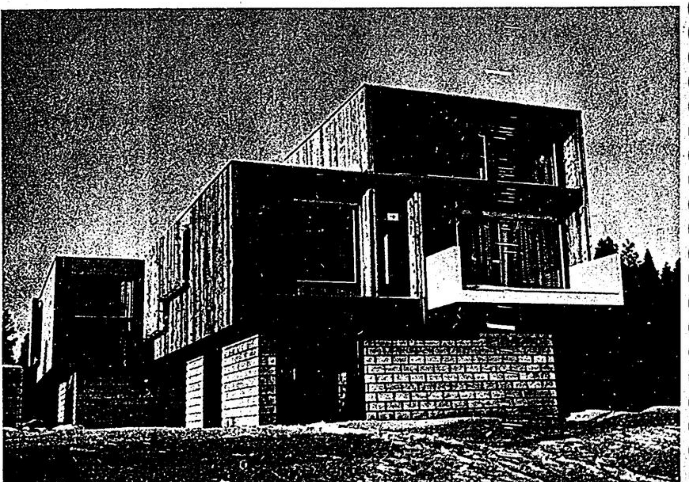
Uniquely designed home, Bethesda Road, Whitchurch Township