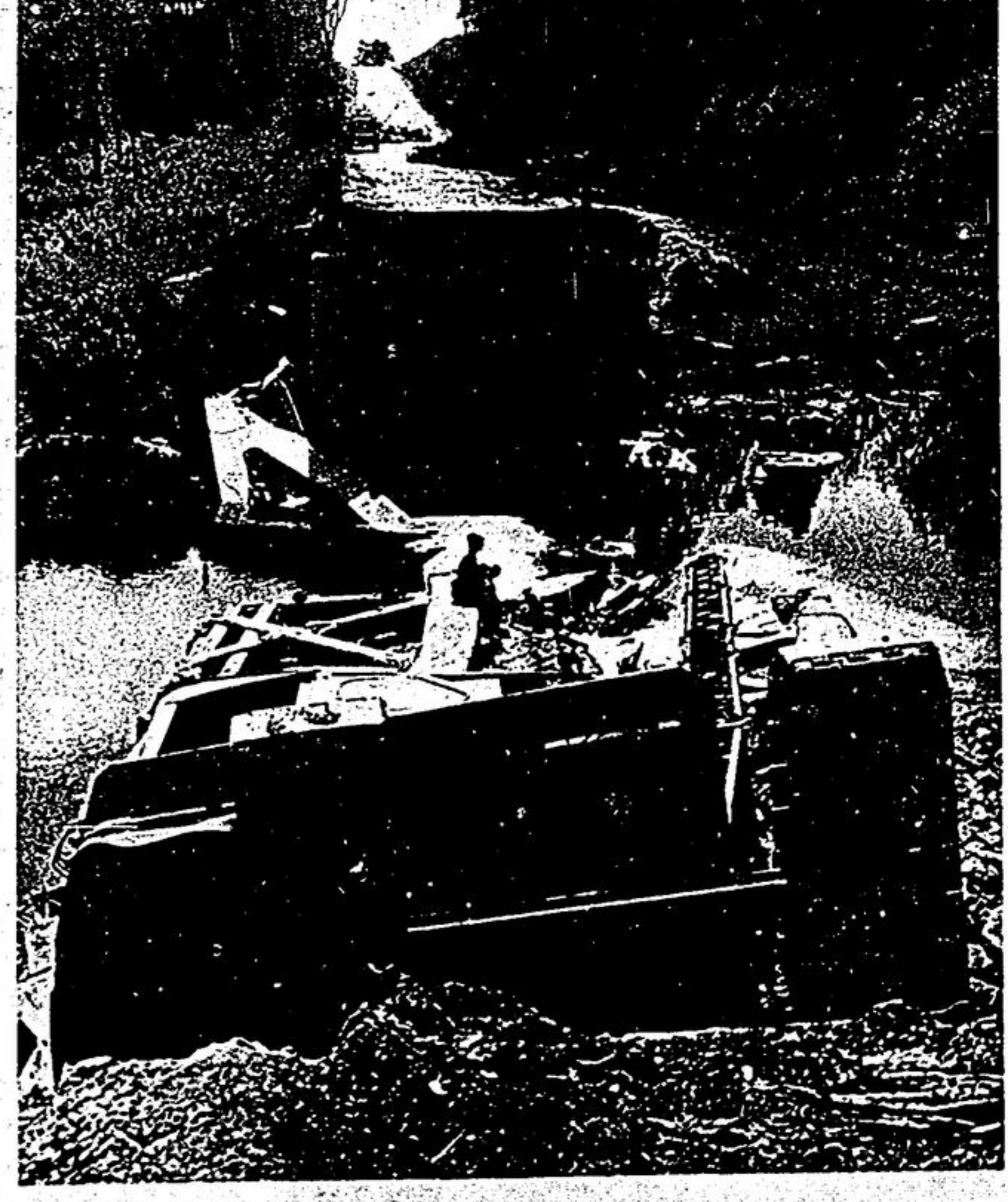
Workman has narrow escape at Freeman bridge collapse.