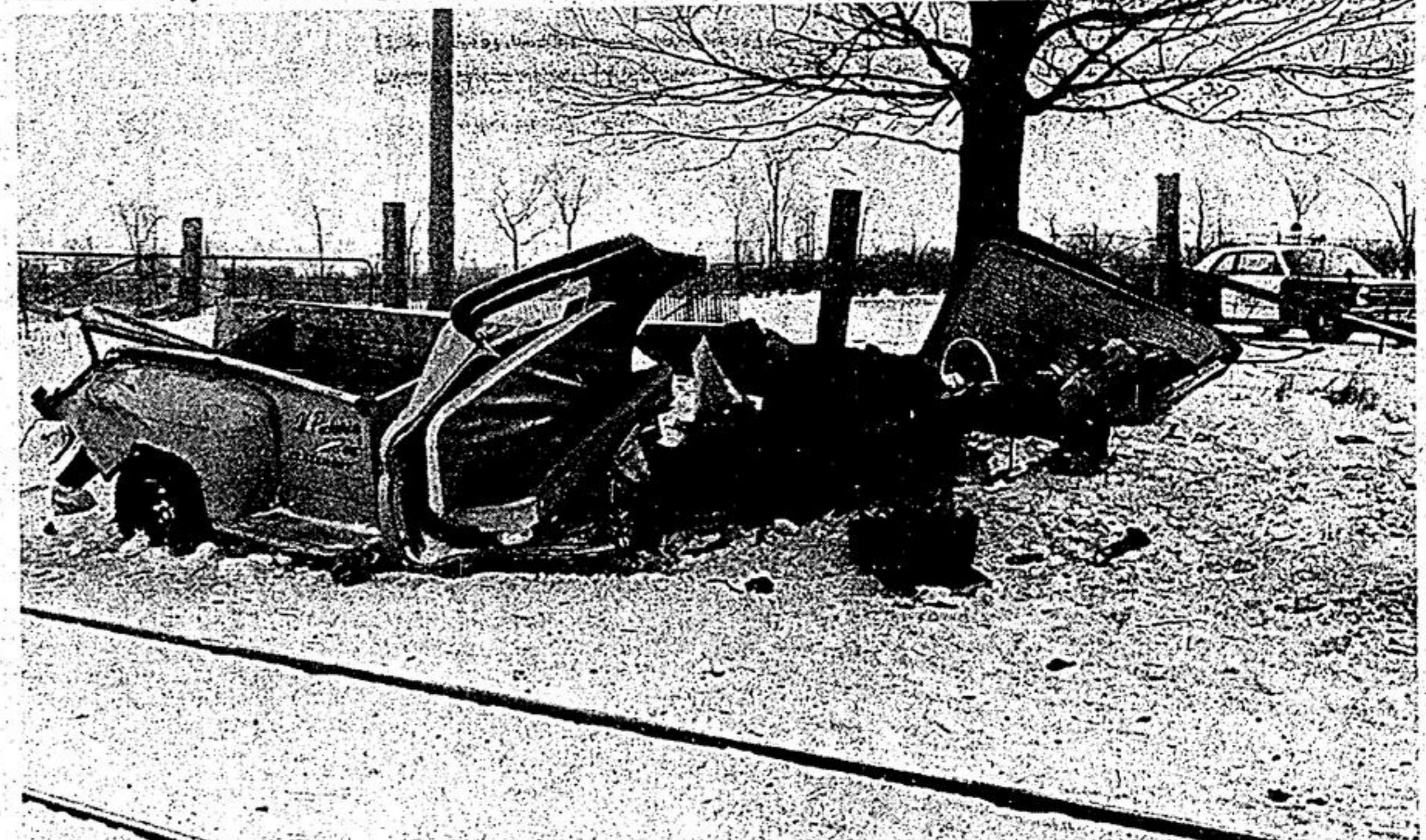
Jim Pickering of Claremont, killed in tragic train-truck crash.