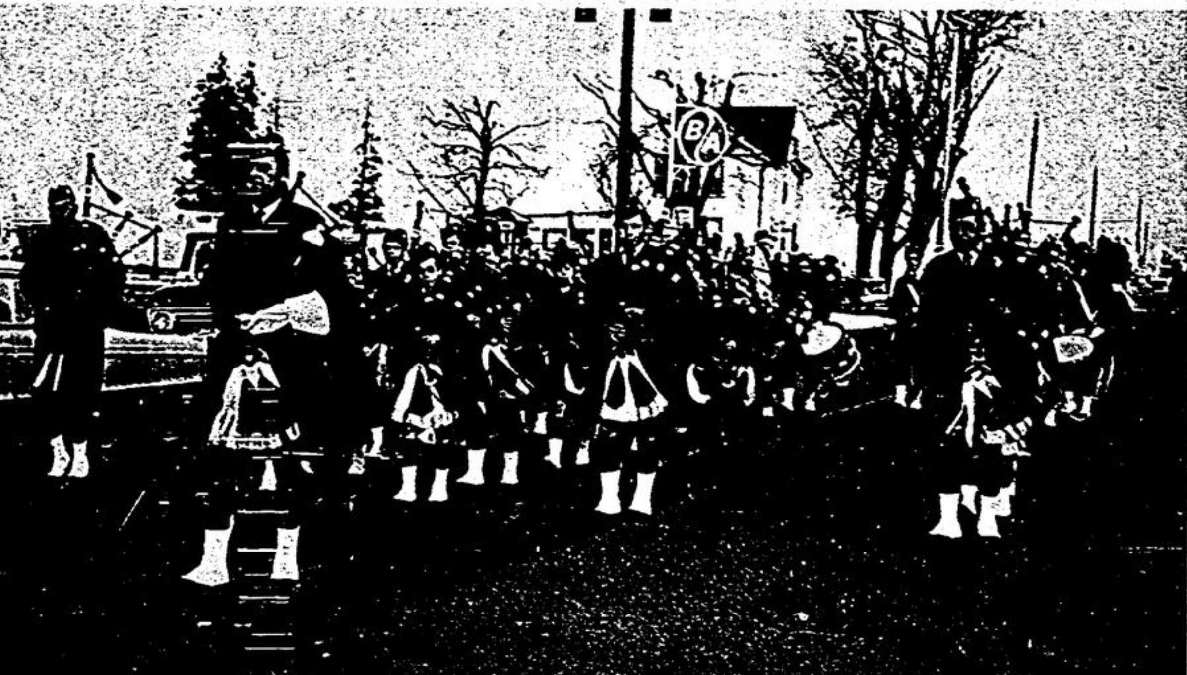
"The pipers are coming" — One of the outstanding contributions to the success of Stouffville's Santa Parade, was the fine pipe band of the Uxbridge Legion.