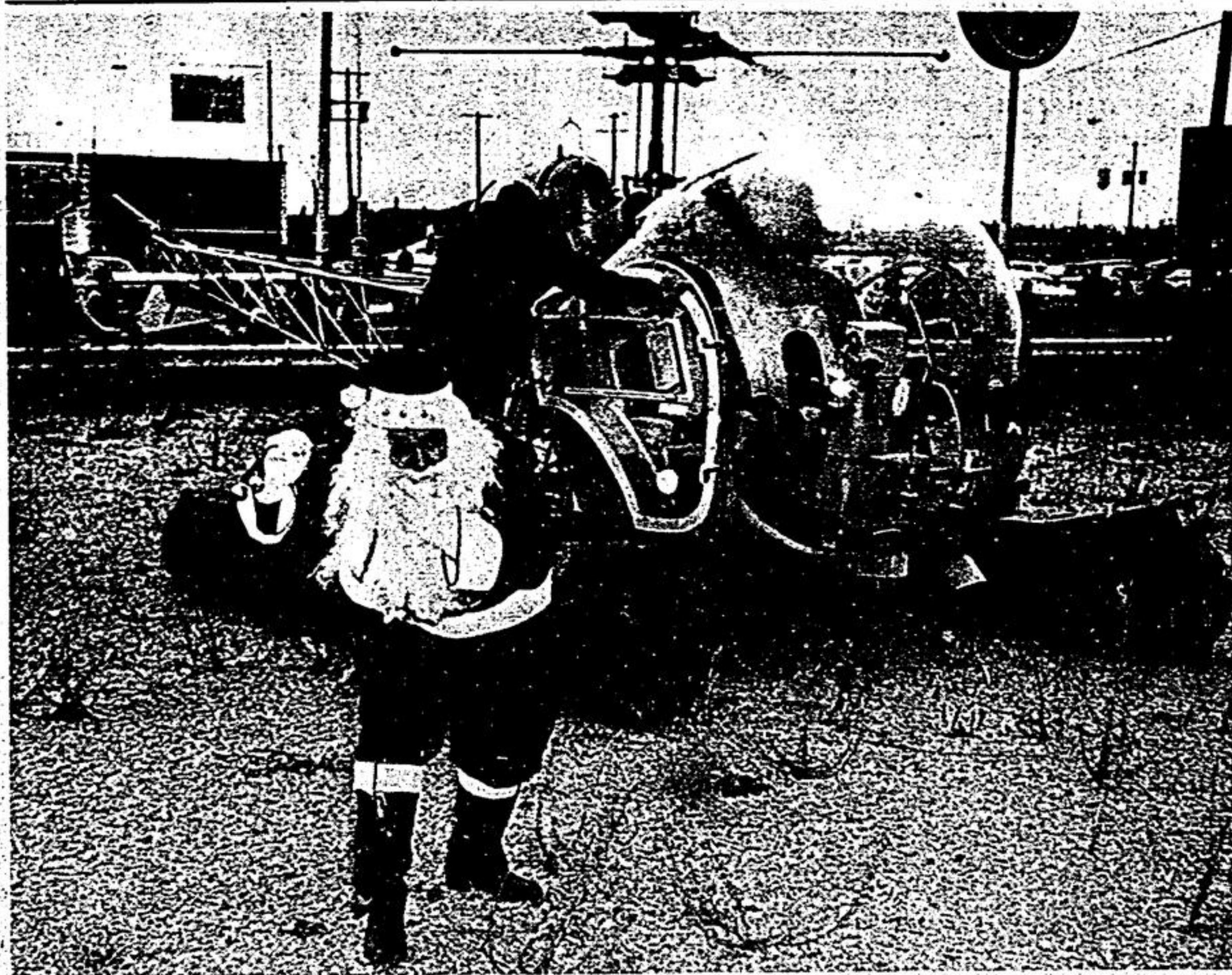
A whirlybird landing for Santa at Markham Plaza