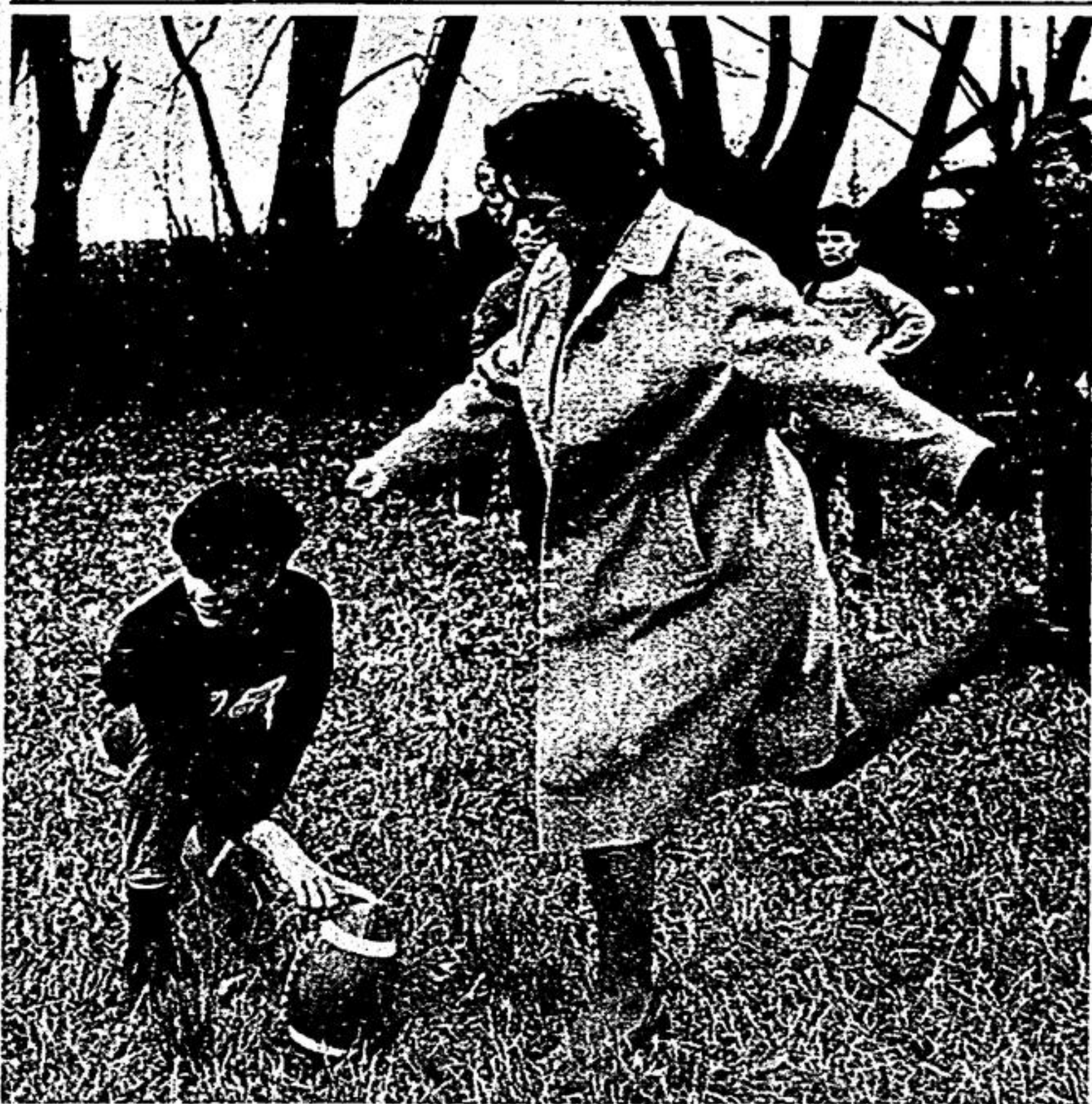
A school trustee with plenty of 'kick'