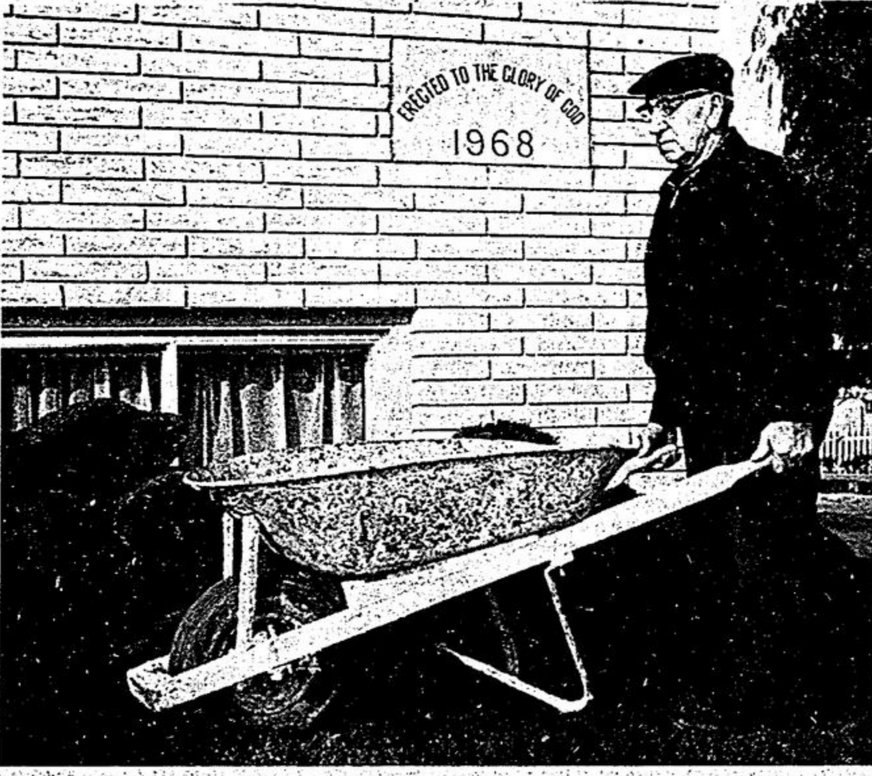
Willing hands found plenty of jobs to do. No man was busier than church caretaker, Asa Byers.