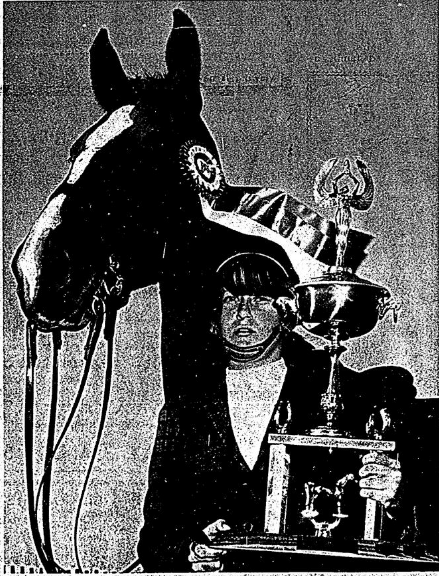
Young rider wins challenge trophy