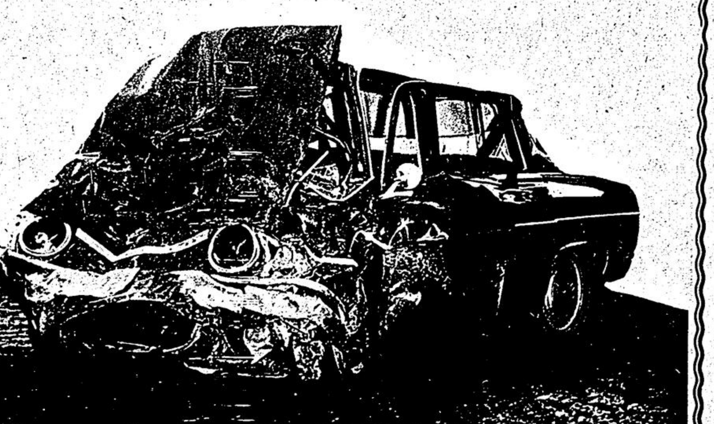
Passenger died in the wreckage of this car, Don Mills Road, Markham Township.