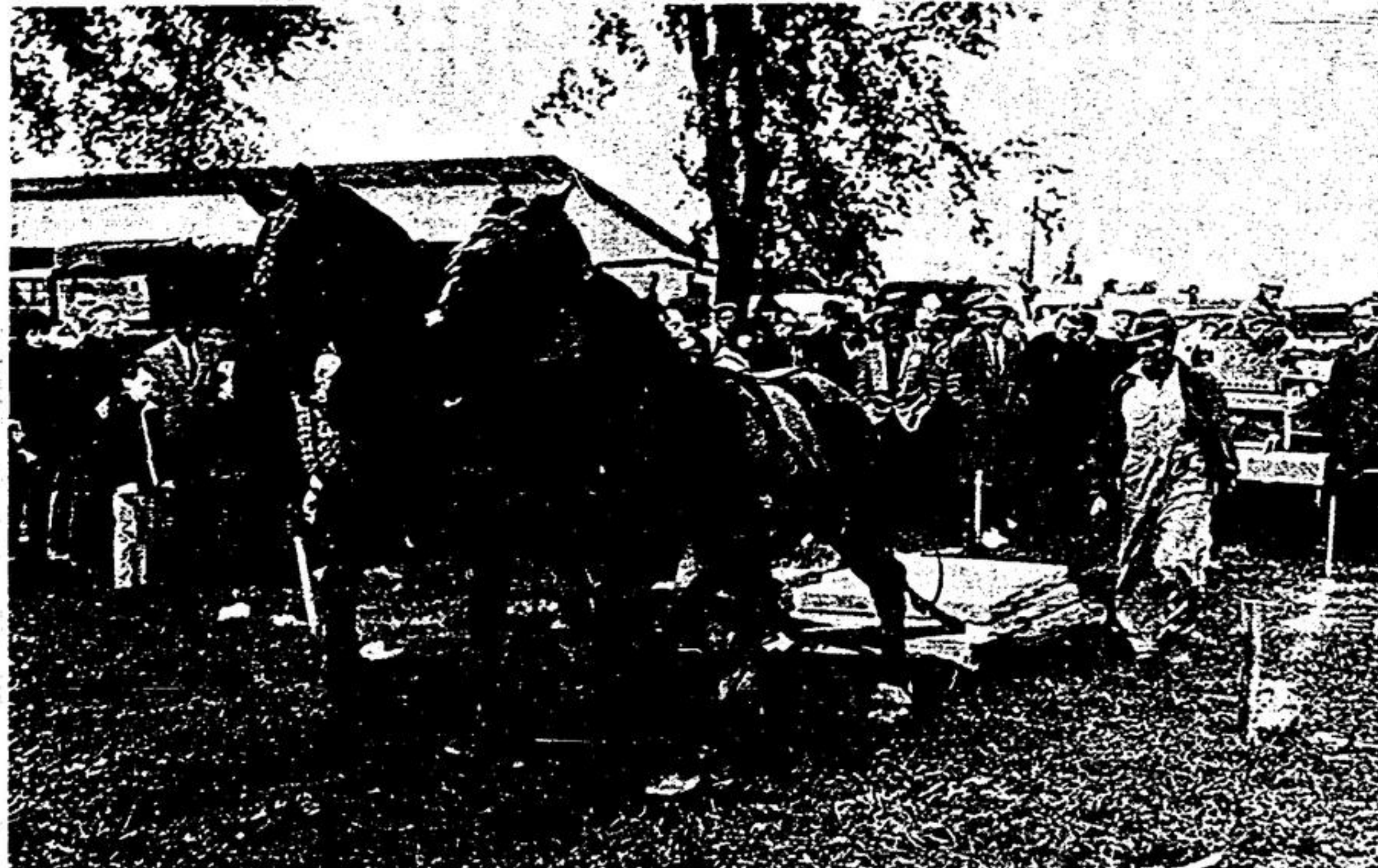
One of the features at the Fair on Friday will be the horse-pulling contest where teams compete to draw the heaviest load.

Stouffville Sales & Service R.R. #4 Stouffville, Ont. Tel. 646-1814