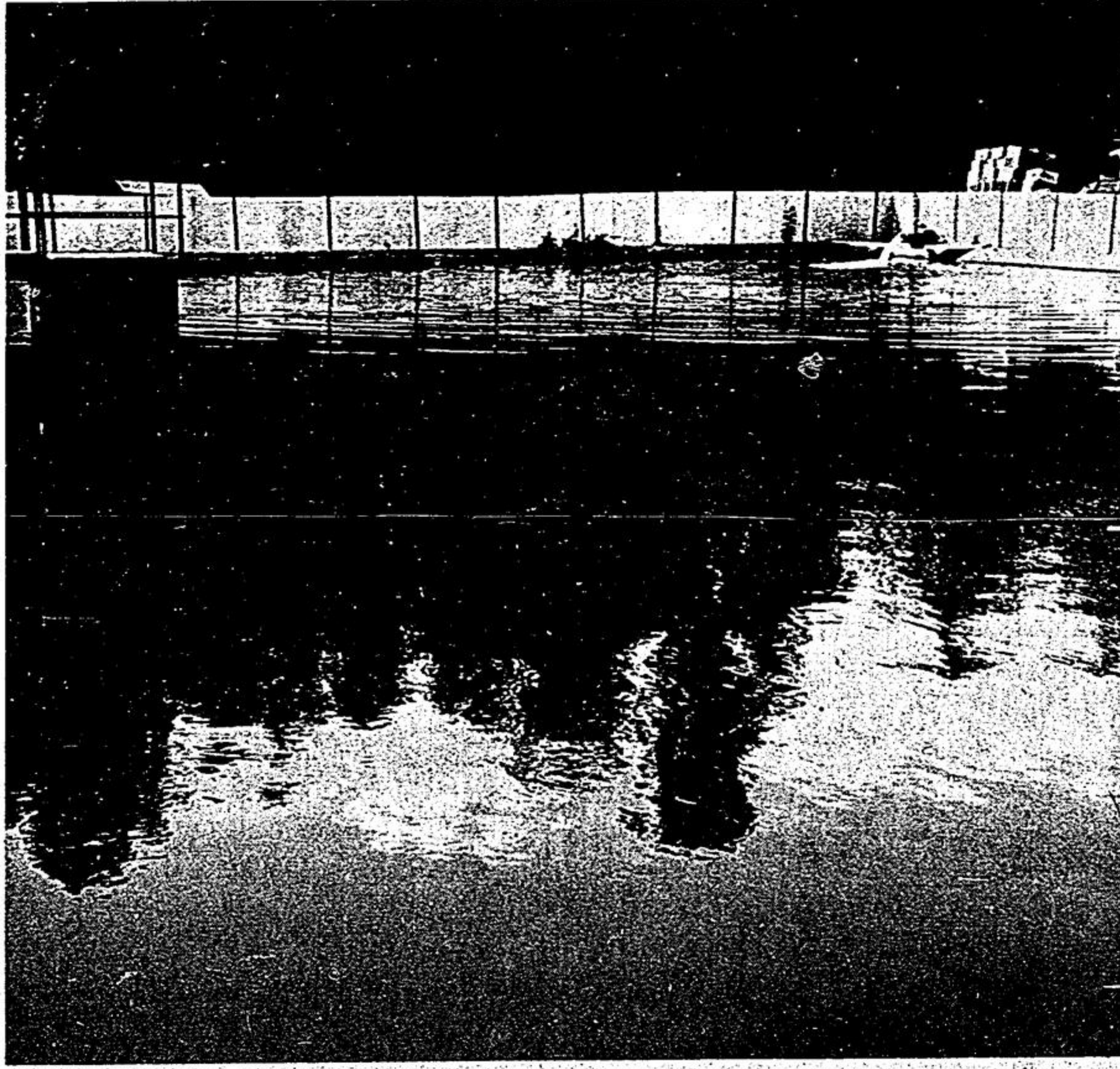
A good view of part of the present town water storage capacity. Water from one of the several wells is shown feeding in at the far right hand upper corner of the picture. This storage will be doubled by the new reservoir.