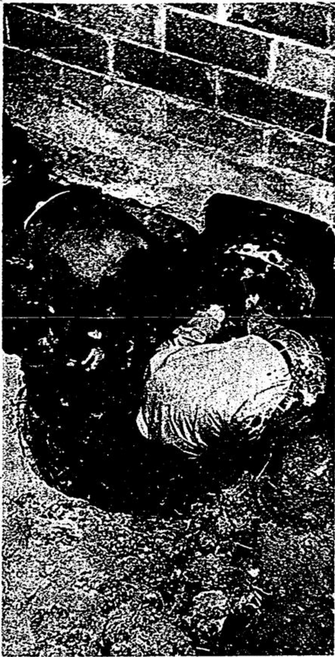
Two P.U.C. workmen preparing a large 12-inch outflow iron pipe, part of the new enlarged water-works project.