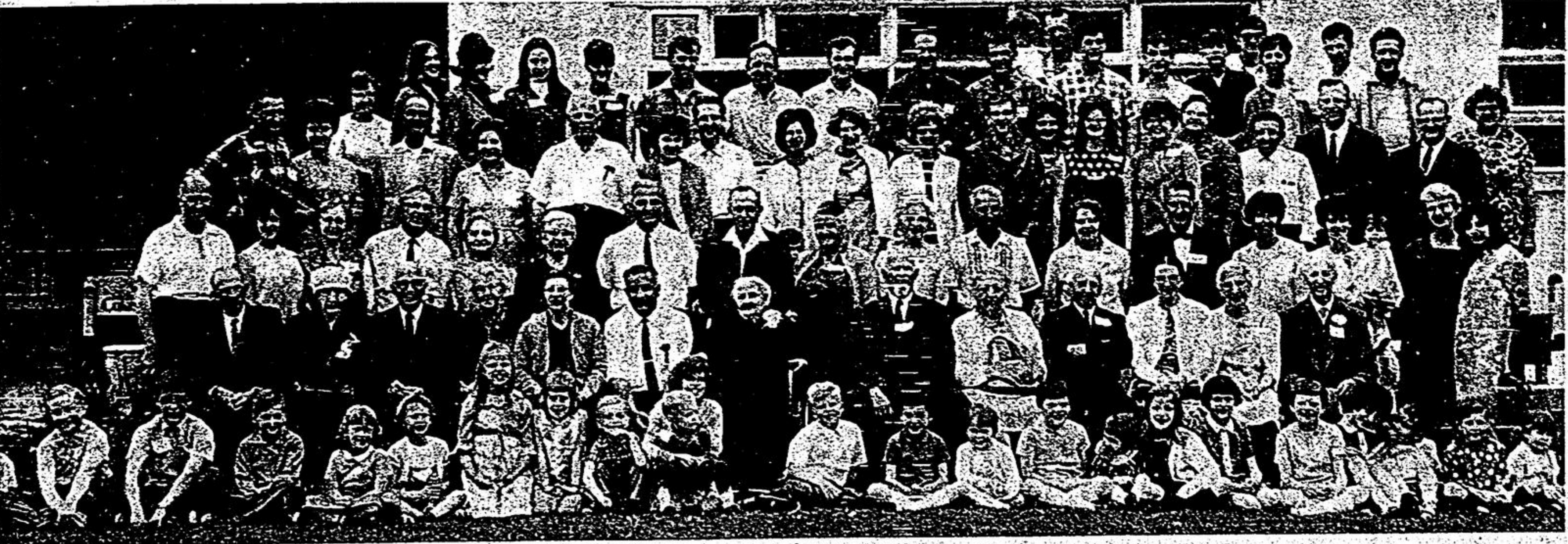
Barkey reunion 1968