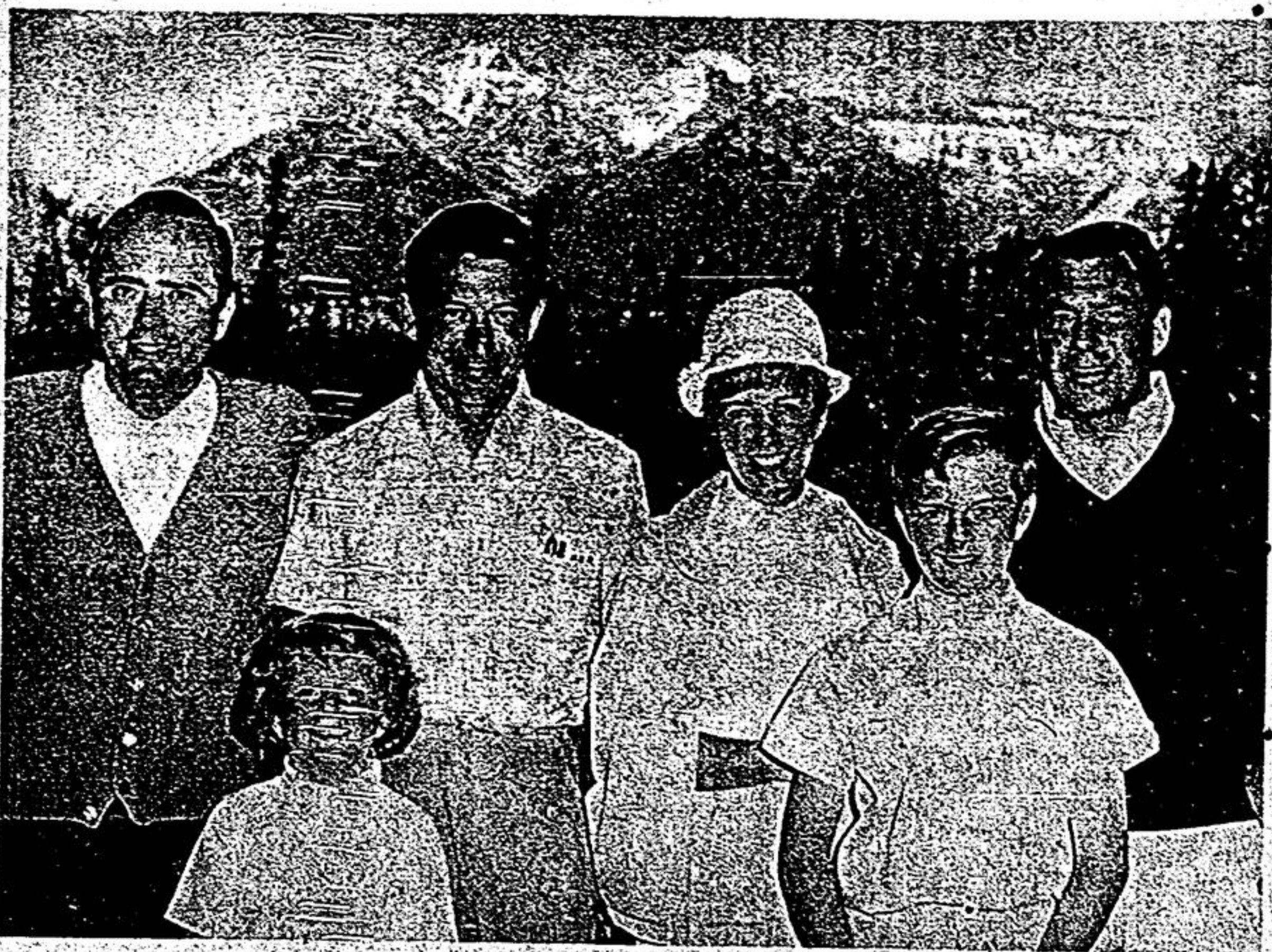
Vacation time in the Canadian Rockies

And now, Whitechurch will be doubling its number of taxis to a grand total of two.