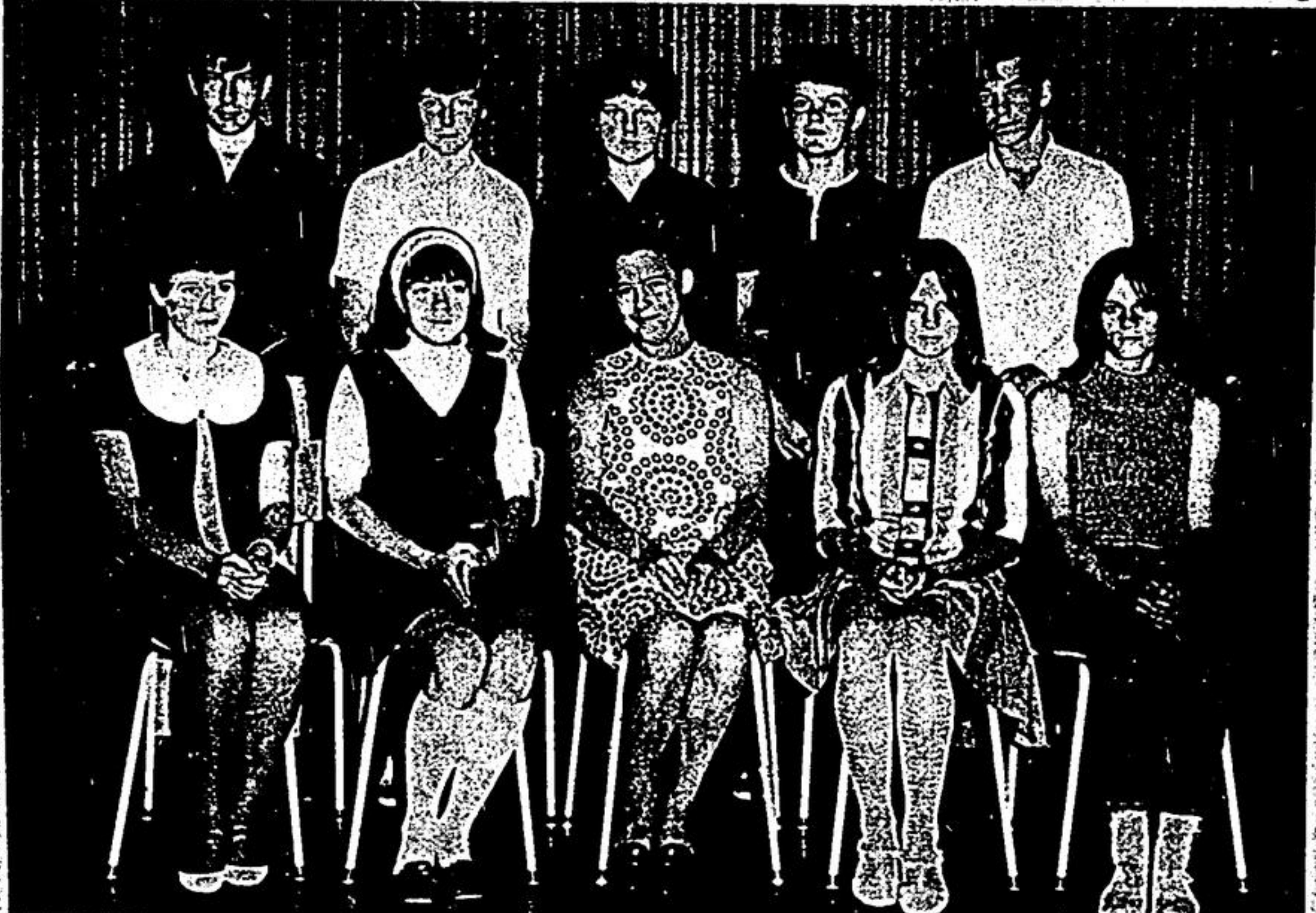
Grade 8 graduates St. Mark's School