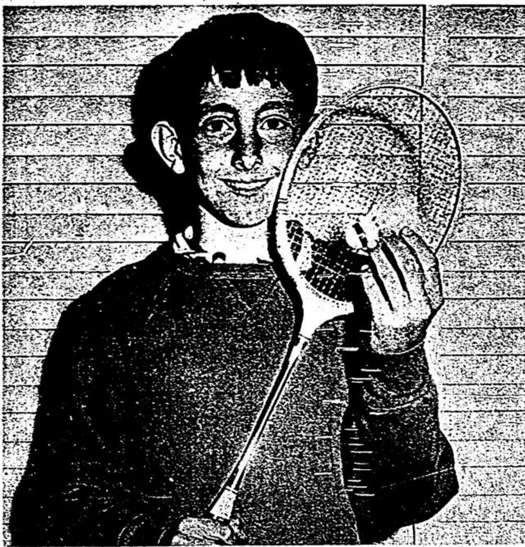
Orchard Park badminton champion